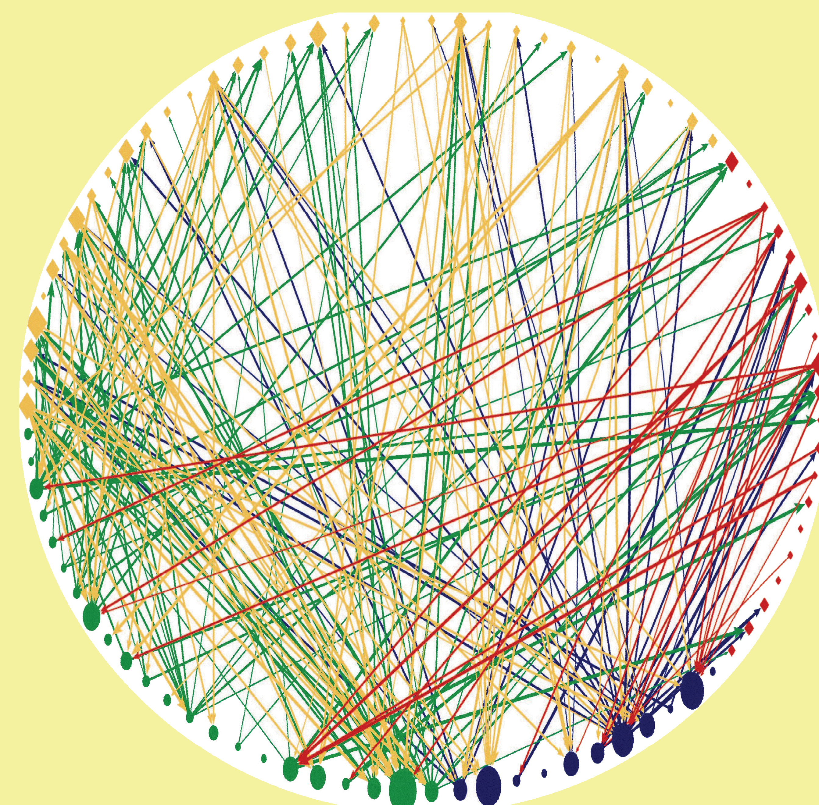
Figure 1. Schematic of referral network. This figure demonstrates the referrals made by and received from the 87 responders. (47% of allopathic practitioners responded, and 45% of CAM practitioners responded). The size of the circle or diamond is proportional to the number of referrals the practitioner received. The color of the line represents the referring practitioner and the arrow points to the practitioner receiving the referral. The line thickness is proportional to the frequency of referral (thinnest = “rarely,” medium = “sometimes,” and thickest = “often”).