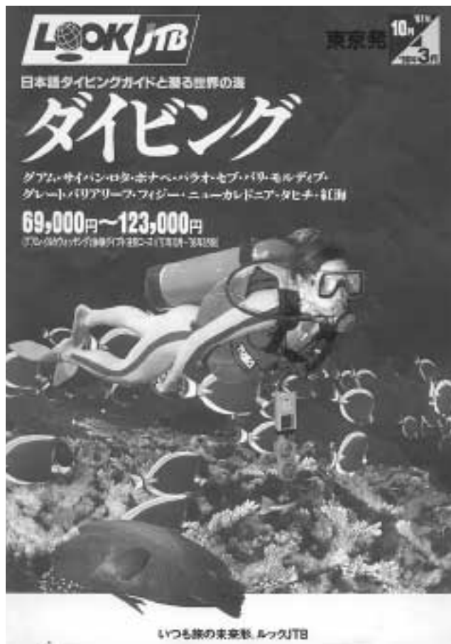
PHOTO 2. Diving tourism. (Front cover of Japan Tourist Bureau brochure)

Apart from the divers, some Japanese tourists, mainly veterans and their families, visit Palau for memorial services. In the last stages of the Pacific War, many Japanese soldiers were killed in the battles with the United States military. Some of the fiercest battles were fought in Palau in