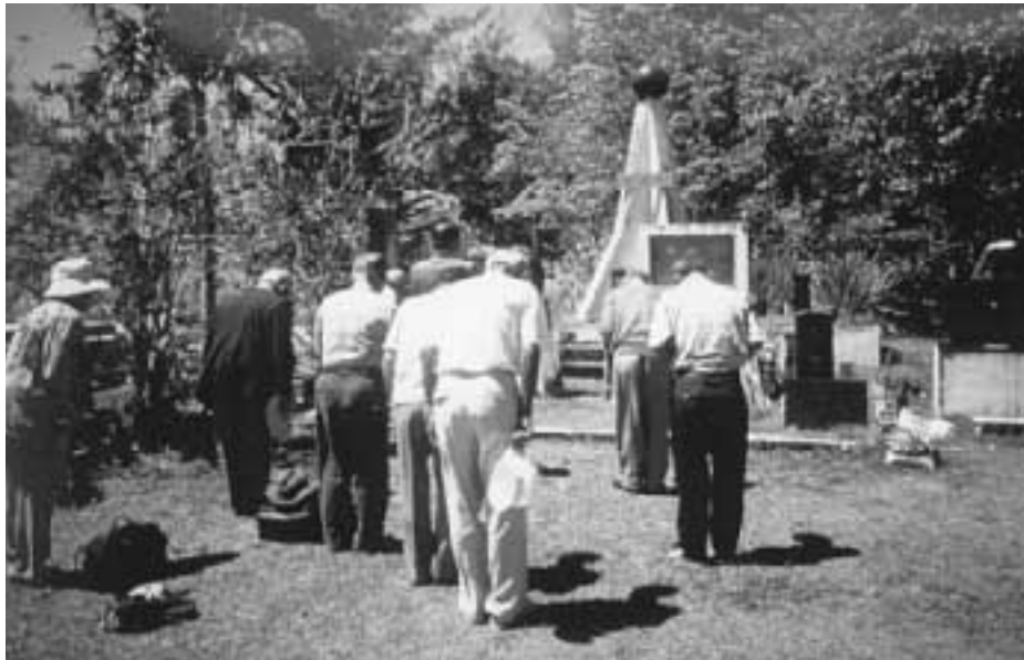
PHOTO 3. Memorial tourism at Peleliu.

Some tourists lived in Palau during the Japanese colonial period. In 1941, approximately thirteen thousand Japanese resided in the town of