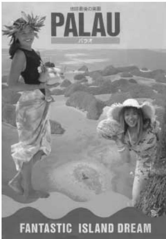
PHOTO 1. Palau, the last paradise. (Front cover of Palau Visitors Authority brochure)

Although most (85 percent) of Japanese tourists use package tours, they do not necessarily behave as a group. Unlike the former stereotypical image of Japanese tourists marching behind the upraised flag of a tour