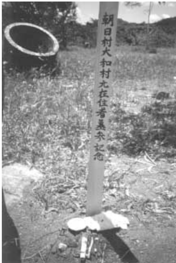
PHOTO 4. Memorial tourism at Asahi-mura and Yamato-mura, former Japanese settlements on Babeldaob.

Younger Japanese who come to Palau only for the diving are often unaware that Palau was once a Japanese colony. In addition, the tourist