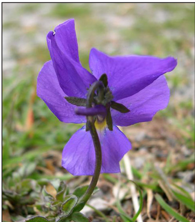
Figure 5. Viola pseudogracilis Strol. subsp. pseudogracilis viola gracile , from Sannio area, Campania Italy.