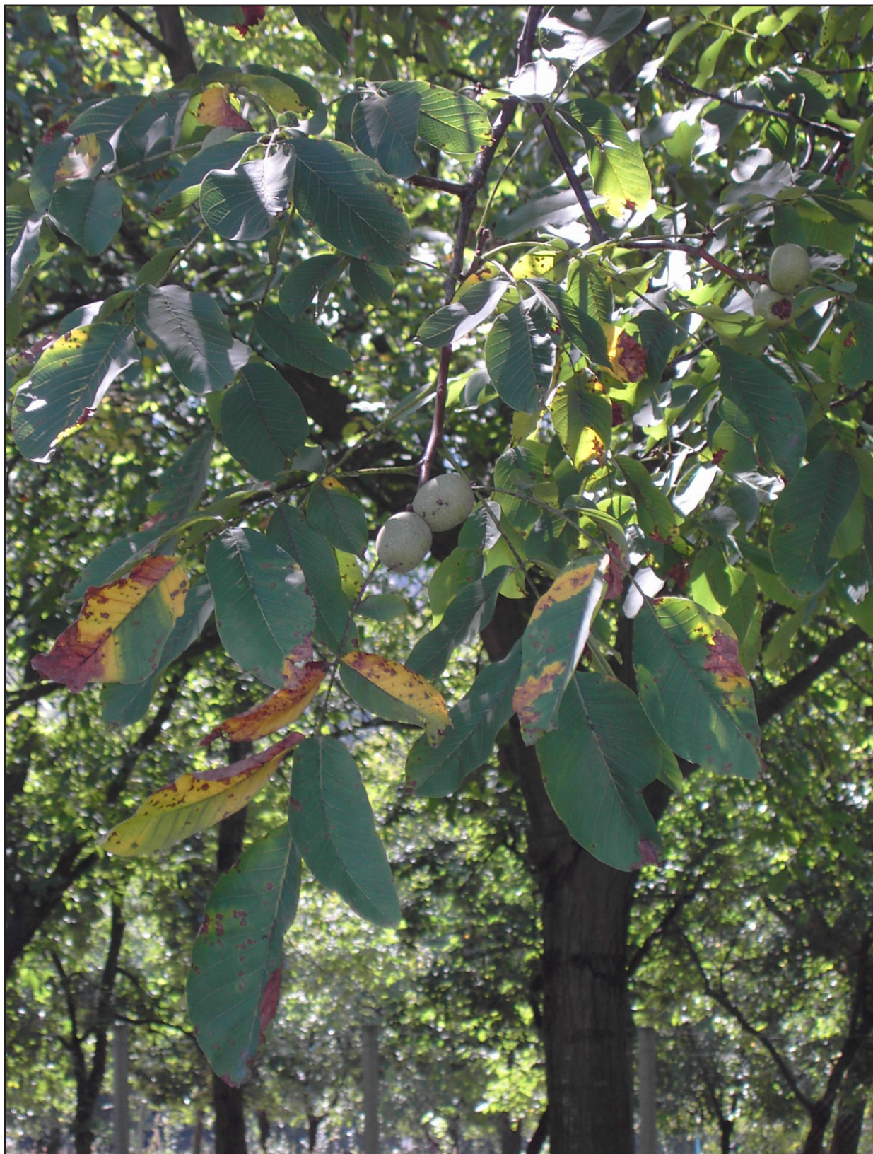
Figure 8. Juglans regia L. noce comune , from Sannio area, Campania Italy.