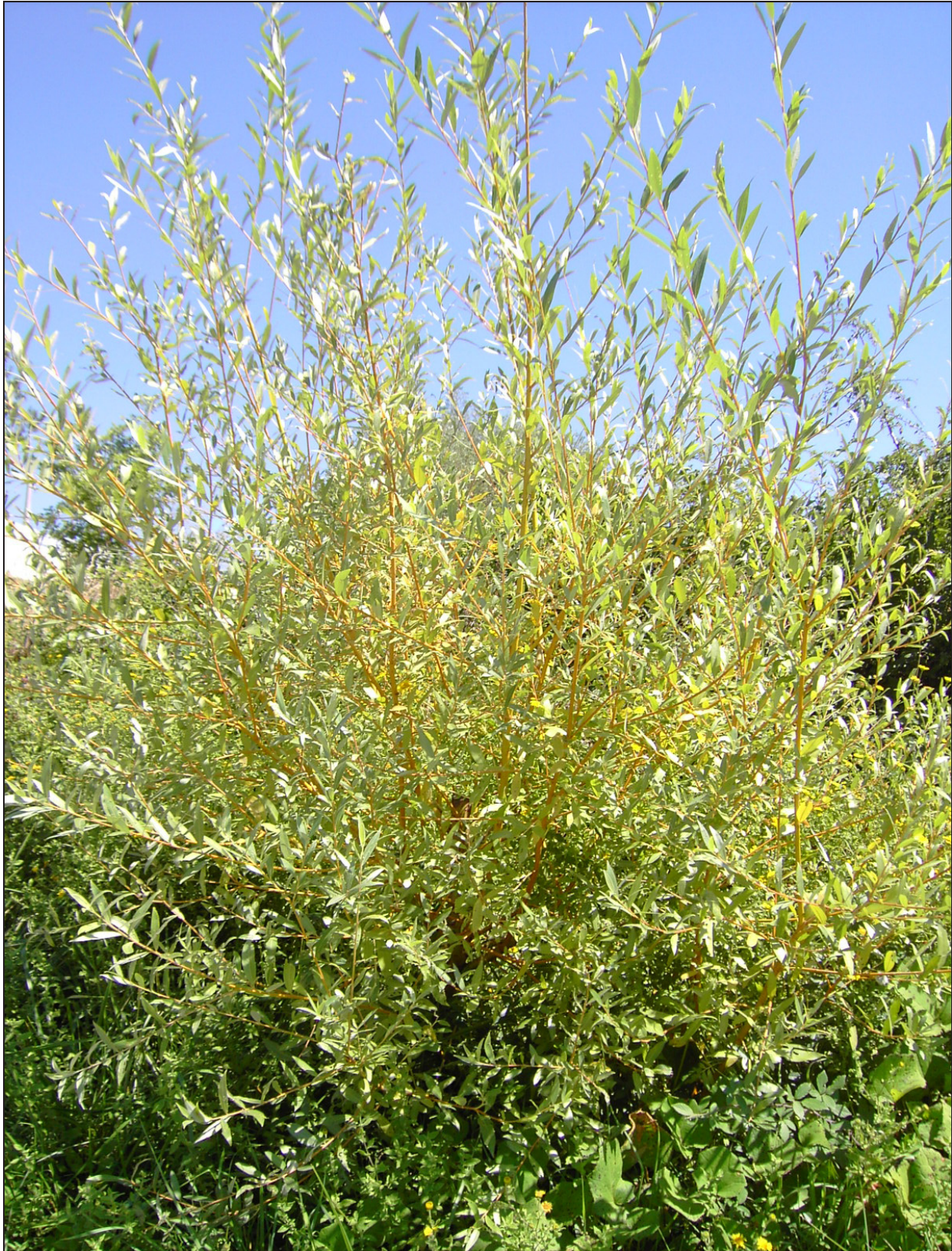
Figure 9. Salix viminalis L. salice da vimine , from Sannio area, Campania Italy.