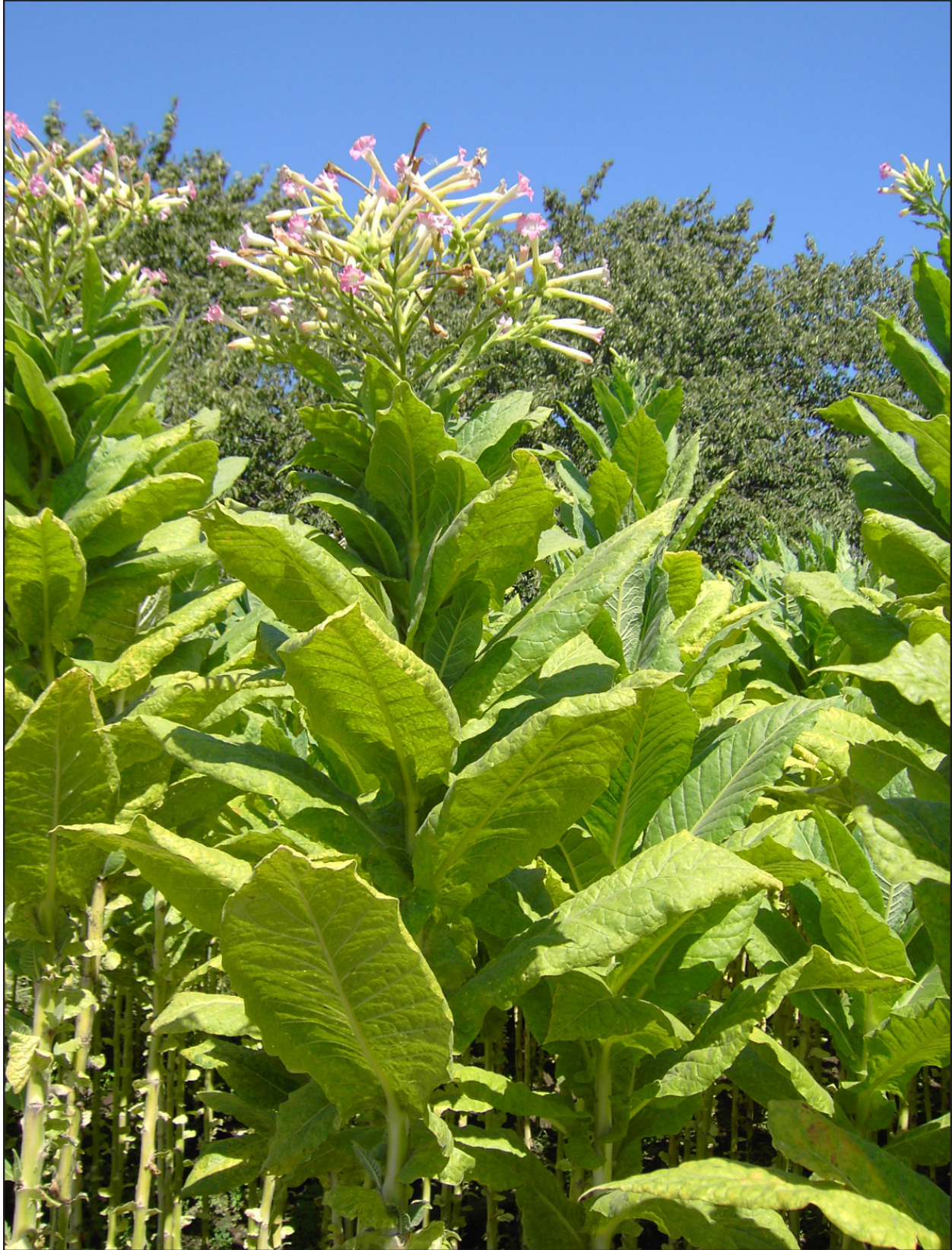
Figure 7. Nicotiana tabacum L. tabacco , from Sannio area, Campania Italy.