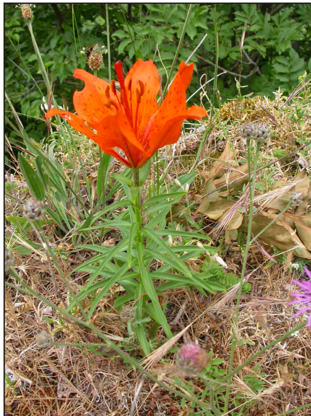
Figure 4. Lilium bulbiferum L. giglio rosso , from Sannio area, Campania Italy.