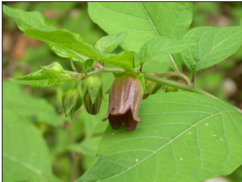
Figure 1. Atropa belladonna L. belladonna , from Sannio area, Campania Italy.

ing been used for medicinal purposes by indigenous societies (Raven & Crane 2007). The greatest market for medicinal plants, both in terms of manufacturing and consumption, are in Europe and Asia (WHO 2006). In Italy, the past decade has witnessed a tremendous resurgence in the interest and use of medicinal plant products. Surveys of plant medicinal usage by the Italian public have shown an increase from just about 5% of the population in 1991 to over 25% in 2006 (Pomposelli et al. 2006). The beneficial medicinal effects of plant materials typically result from the combination of secondary products present in plants. That the medicinal actions of plants are unique to particular plant species is consistent with the concept that the combinations of secondary products in a particular plant are often taxonomically distinct. This is in contrast to primary products, such as carbohydrates, lipids, proteins, chlorophyll and nucleic acids, which are common to all plants involved in the primary metabolic processes. In fact, some medicinal plants, such as the opium poppy, have long been recognized and widely used, while others, such as Colchicum neapolitanum Ten., the original source for an anticancer drug, are new arrivals to mainstream medicine. In addition to providing the basis for 30-40% of today's conventional drugs, the medicinal and curative properties of various plants are also employed in herbal supplements, botanicals, nutraceuticals and teas.