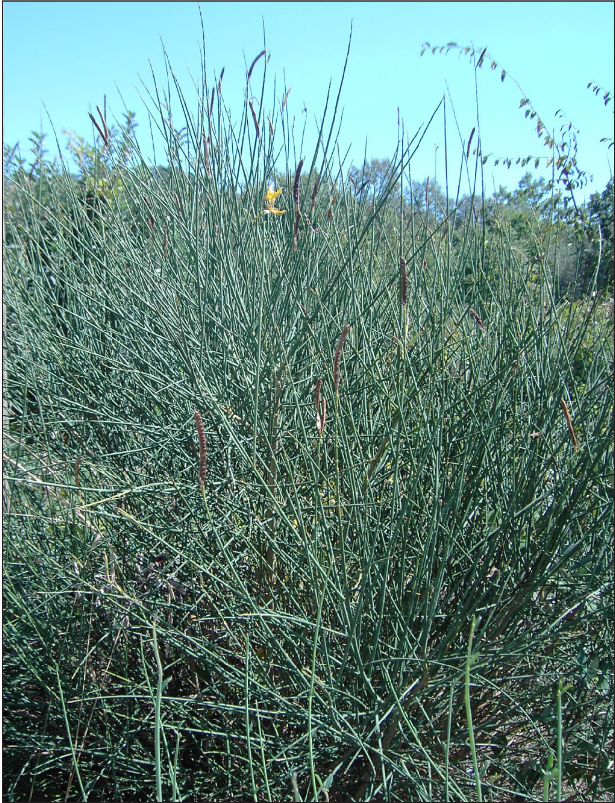
Figure 6. Spartium junceum L. ginestra comune , from Sannio area, Campania Italy.