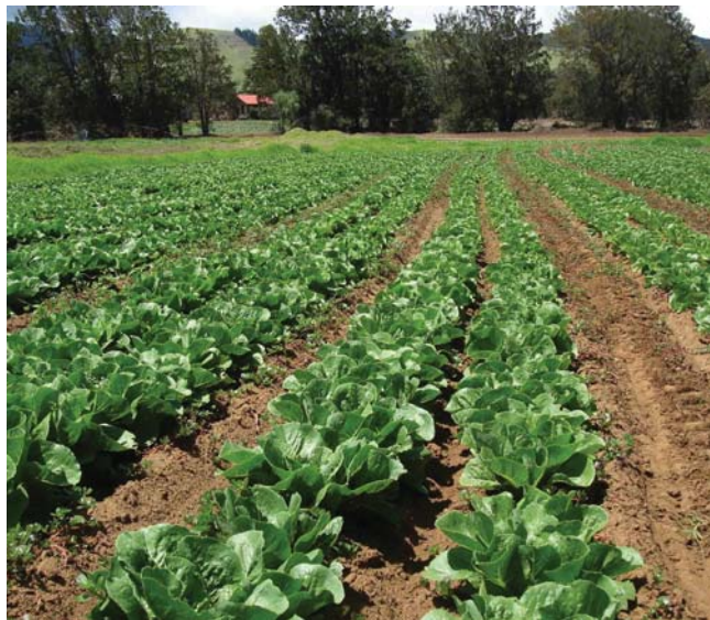
Romaine lettuce production in Lālāmilo, Hawai'i

We conducted two field experiments to evaluate romaine lettuce yield response to increasing concentrations of soil P at the Lalamilo Research Station in Waimea, Hawai'i, and the Kula Research Station on Maui. Climatic conditions and soil type are similar at both stations (Table 1). At the Lalamilo site we imposed four P treatments equivalent to 0, 30, 60, 120, and 240 lb P per acre arranged in a randomized complete block with four replicates. At the Kula site, five P treatments (0, 598, 2384, 3336, and 4765 lb P per acre) were imposed to ensure a wider range in target soil P concentrations at the high end (high quantities of P fertilizers are required in these volcanic ash soils to overcome their high P adsorption capacity). Phosphorus as triple superphosphate (TSP) was broadcast evenly across each plot and tilled in to a depth of 6 inches. Nitrogen, as urea, was broadcast with the TSP at 50 lb N per acre and side-dressed twice during the cropping cycle at 75 lb N