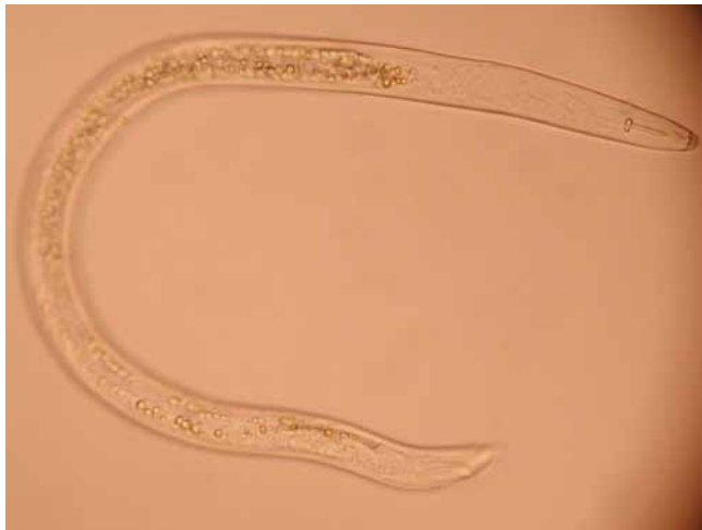
Helicotylenchus multincinctus male