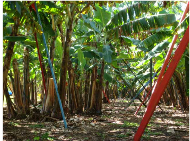
Figure 4. An old banana farm with plants propped up by sticks to avoid toppling due to heavy bunch weight and nematode-damaged root systems.

Preventing the spread of pests and diseases is one of several advantages for using tissue-cultured plantlets.