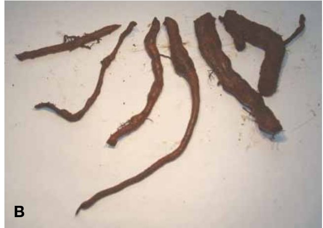
Figure 2. (A) root lesions (darkened areas) caused by endoparasitic nematodes on banana; (B) root galls (swollen areas) caused by root-knot nematodes on banana.

mainly only attack the outer cells of the root and produce smaller and shallower necrotic lesions that develop more slowly than those caused by burrowing nematodes.