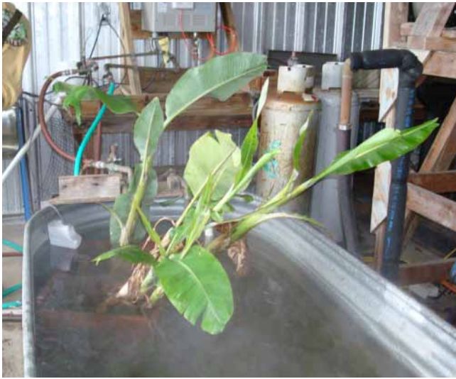
Figure 5. Banana keiki soaking in a hot-water tank with the temperature kept at 50°C for 10 minutes to kill plant-parasitic nematodes.