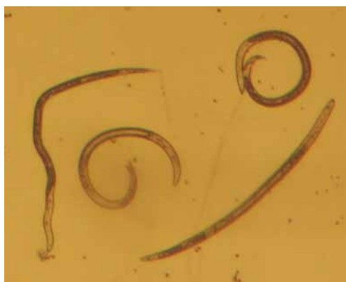
This mixed population of plant-parasitic nematodes, including root-knot, reniform, and lesion nematodes, was extracted from a banana rhizosphere.

Unfortunately, all the nematodes mentioned above are commonly associated with banana roots in Hawai'i. A survey of root-parasitic nematodes associated with banana plantings in Hawai'i was conducted between 2007 and 2008 in 27 banana fields distributed throughout the six major Hawaiian Islands (O'ahu, Hawai'i, Maui, Lāna'i, Moloka'i, and Kaua'i). During the survey, five major genera of nematodes associated with banana roots were found: spiral, burrowing, root-knot, reniform, and lesion ( Pratylenchus coffeae ) nematodes (Fig. 3).