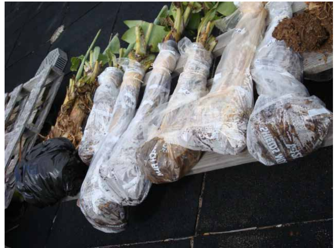
Figure 6. Banana keiki covered in clear plastic and left in direct sunlight to absorb solar heat to kill off plant-parasitic nematodes. A control treatment (left) is wrapped in black plastic.

Soil solarization involves heating the soil beneath a clear (transparent) plastic sheet to reach temperatures lethal to soilborne pests. The method has been successfully used against plant-parasitic nematodes and other soilborne diseases in several crops and regions around the world, especially in hot climates. In addition to investigating the use of soil solarization to manage nematodes in the soil before planting, we are experimenting with a modified solarization technique that involves directly heating nematode-infected banana keiki (Fig. 6). This solarization method might provide an effective alternative to hot-water tanks for heat treatment. We hope to