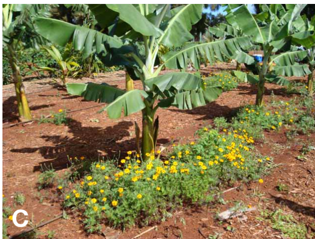
Figure 7. (A) ‘Single Gold’ marigold and (B) ‘Tropic Sun’ sunn hemp used as cover crops before planting banana. (C) Banana interplanted after establishment with marigold to suppress spiral nematodes ( Helicotylenchus multicinctus ).