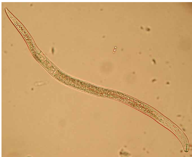
Pratylenchus coffeae female