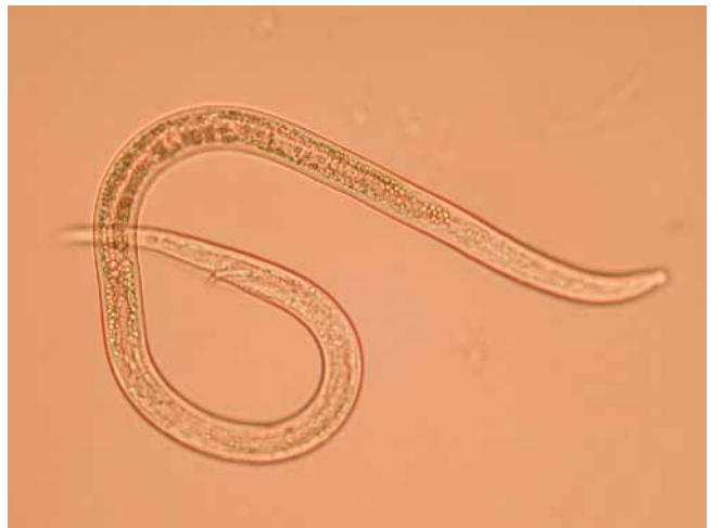
Radopholus similis male