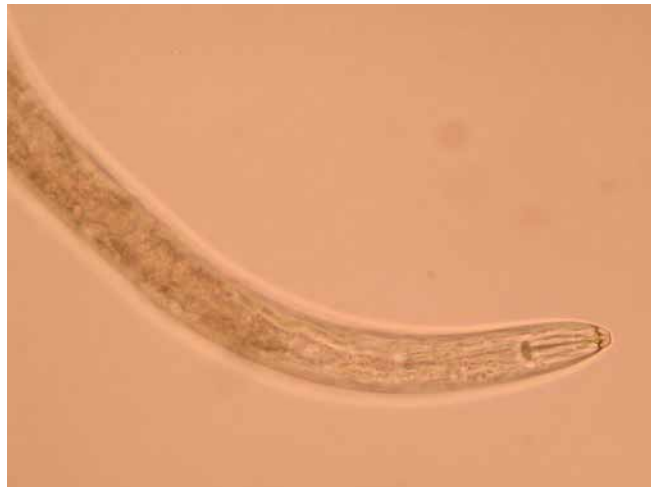
Tail end of a Helicotylenchus multincinctus female