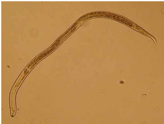
Radopholus similis female