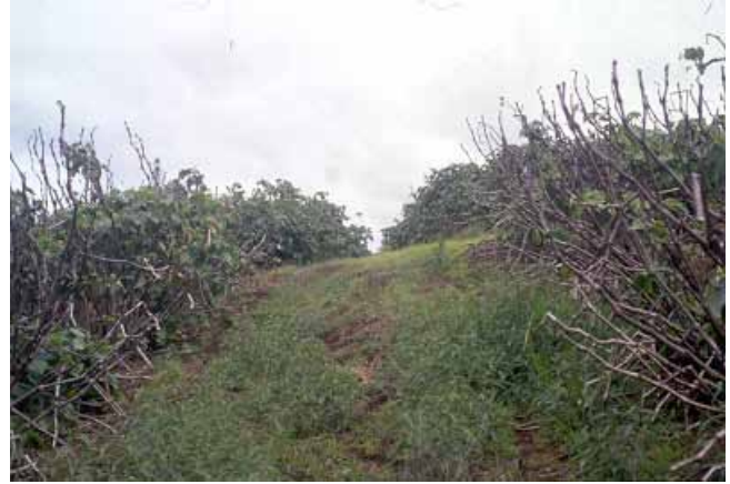
Massive defoliation of 'awa plants in a monoculture on the Hāmākua Coast of the island of Hawai'i