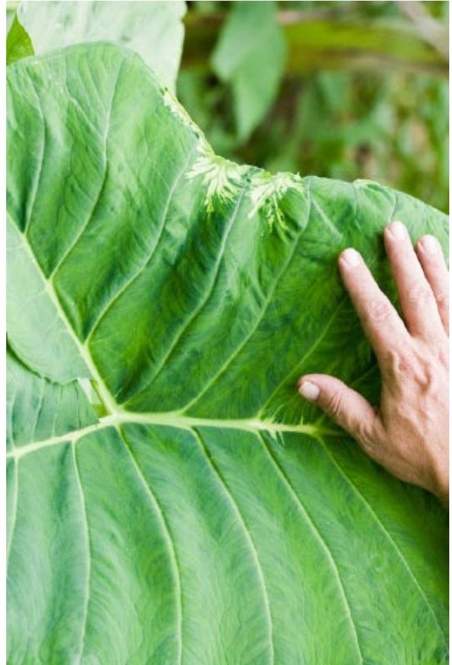
DsMV on Xanthosoma sagittifolium . Left: white feathering symptoms along the leaf veins of X. sagittifolium in Yap. The feathering symptom associated with DsMV is typical of Colocasia and Xanthosoma species. The the newly emerging leaf (mostly obscured here) is grossly distorted. Right: leaf distortion (puckering) associated with DsMV and the white feathery symptom on X. sagittifolium in Yap.

Pathogen survival: DsMV survives as viable virus particles within living plant tissues, or for short periods of time in association with the mouthparts of aphid species or as infested sap on tools. DsMV is unable to survive in dead plant tissues or in dead aphids.