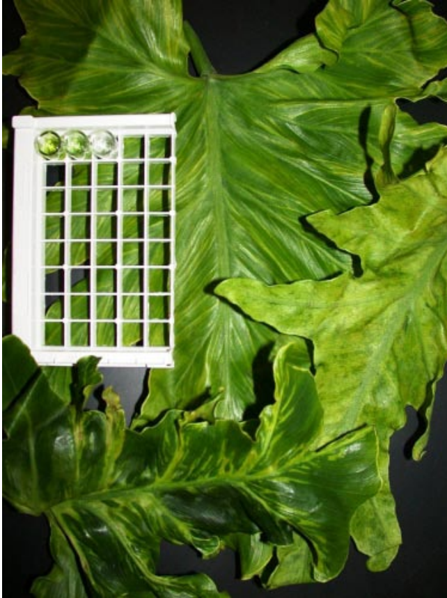
Symptoms of dasheen mosaic on Philodendron : Leaves of Philodendron x cv. 'Hope' as a host of DsMV in Hawaii. The test kit shows a positive reaction to potyviruses. The virus was confirmed by ELISA and PCR. Symptoms on this Philodendron include mosaic, green islands, deformity, rugosity, epinasty, curling, yellowing and vein clearing. The cultural practices used by the grower included vegetative propagation of this plant by cutting stems with knives or shears. This may have been the means for mechanical transmission of DsMV in this case.

Dasheen mosaic can cause major economic losses for ornamental crops such as Philodendron ; in this case management of the disease is highly recommended due to the damaging effects upon the plant foliage.