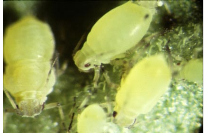
Close-up of adult melon aphids ( Aphis gossypii , adult apterous females, highly magnified) on a kava ( Piper methysticum ) leaf. Colonies of aphids and ants are common on leaves of taro in Hawai'i. Not all aphids found on taro can transmit the virus; for example, banana aphids.