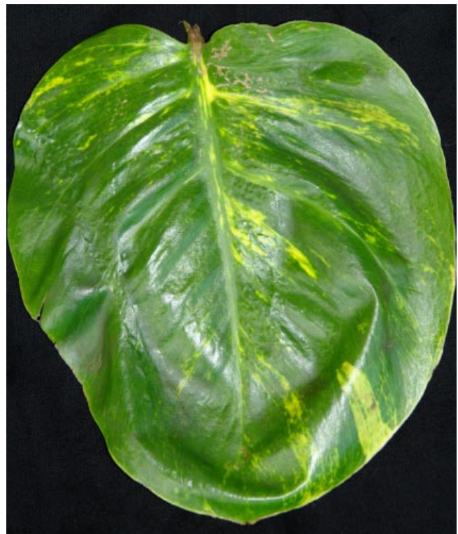
Some variegated aroids do not carry DsMV: Variegated Pothos ( Epipremnum sp.), showing symptoms of leaf mosaic and perhaps yellow veins, and with leaf deformity and rugosity due to feeding injury by aroid thrips. These symptoms should not be confused with DsMV on other aroid hosts. The mosaic symptom is due to genetic variegation, not to disease.