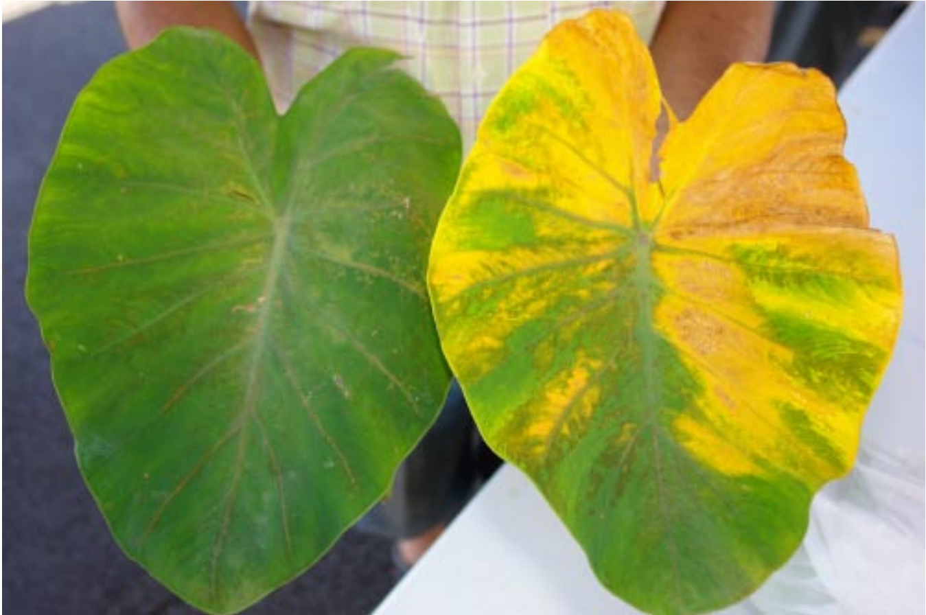
Conspicuous necrotic and chlorotic feathering along leaf veins of a dasheen variety