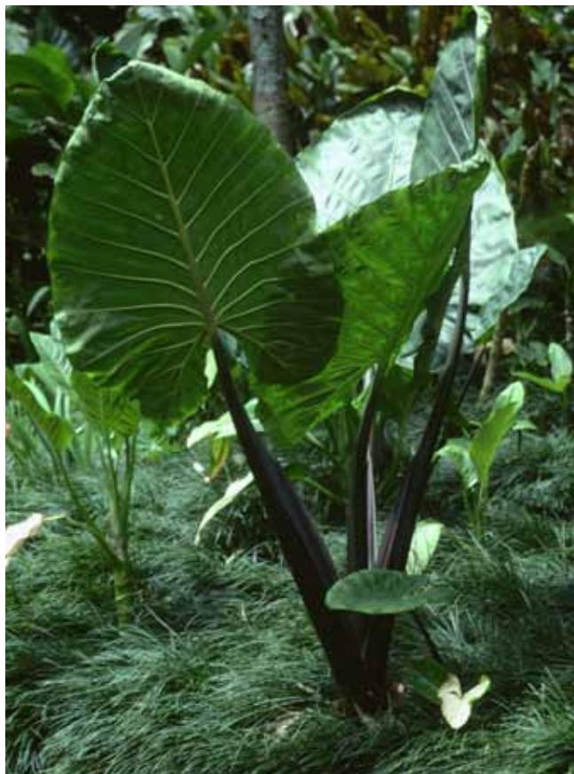
Alocasia macrorrhiza (ape)