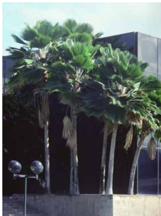
Pritchardia pacifica (Fiji fan palm)