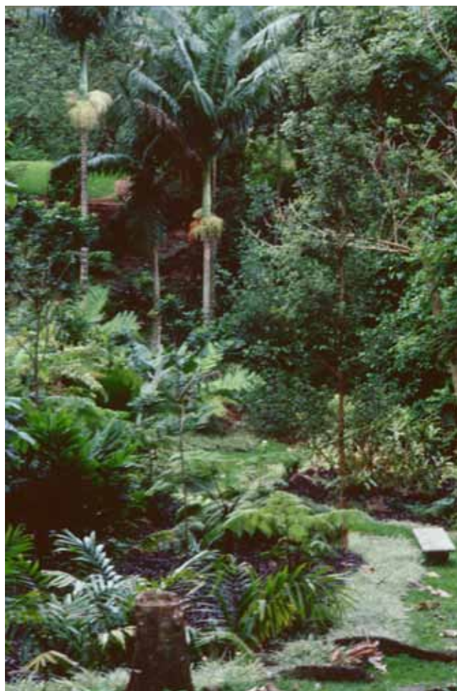
Lyon Arboretum, O'ahu

The following list of plants reflects the author's preferences. To make an effective all-green tropical landscape you do not need many plants, but the key is to choose plants that go together well.