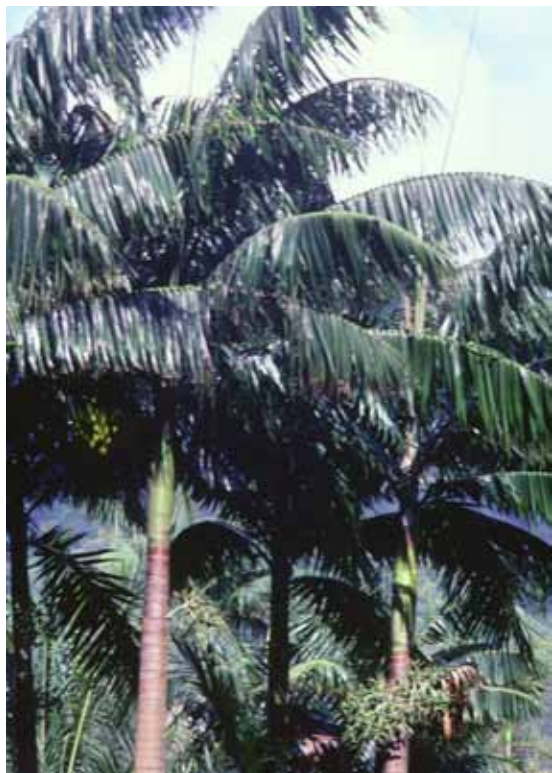
Veitchia joannis (Niusawa palm)