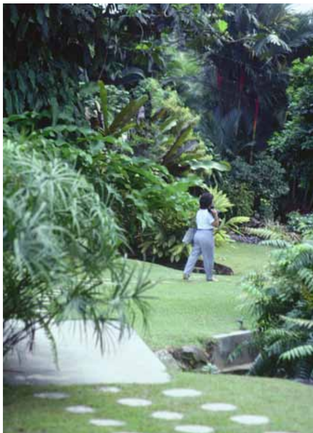
Mandai Orchid Garden, Singapore