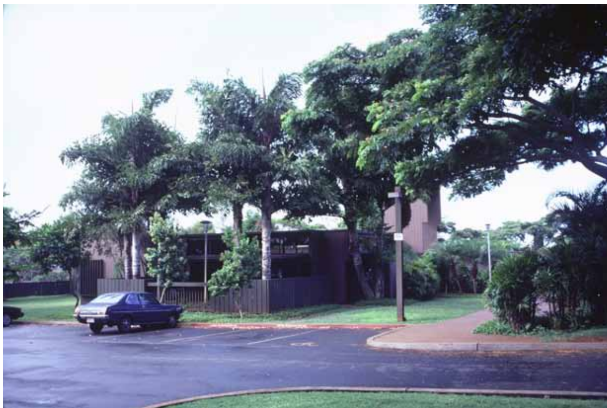
Caryota urens (wine palm)