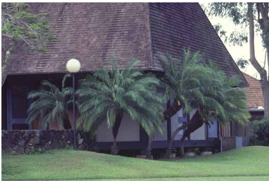
Phoenix roebelenii (dwarf date palm)