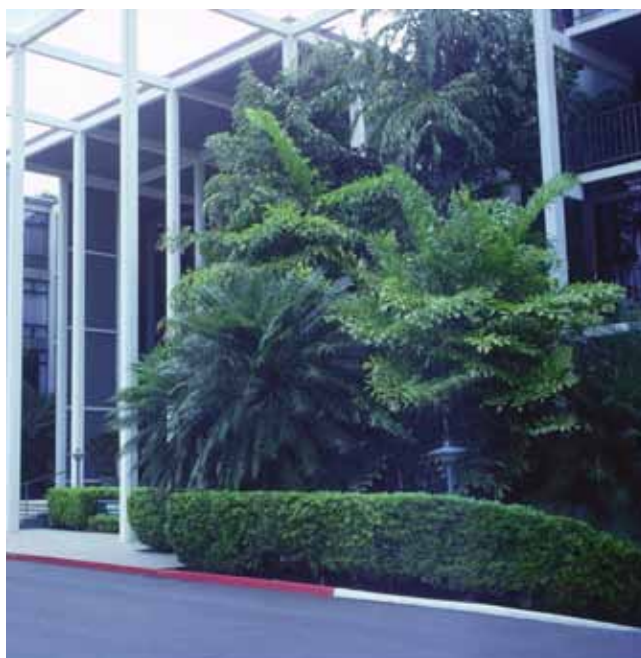
Landscaping at the Kahala Apartments, O'ahu, achieves a "tropical" effect using mostly palms.