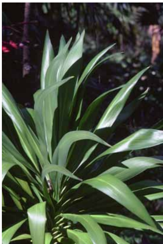
Cordyline bausei (bausei ti)