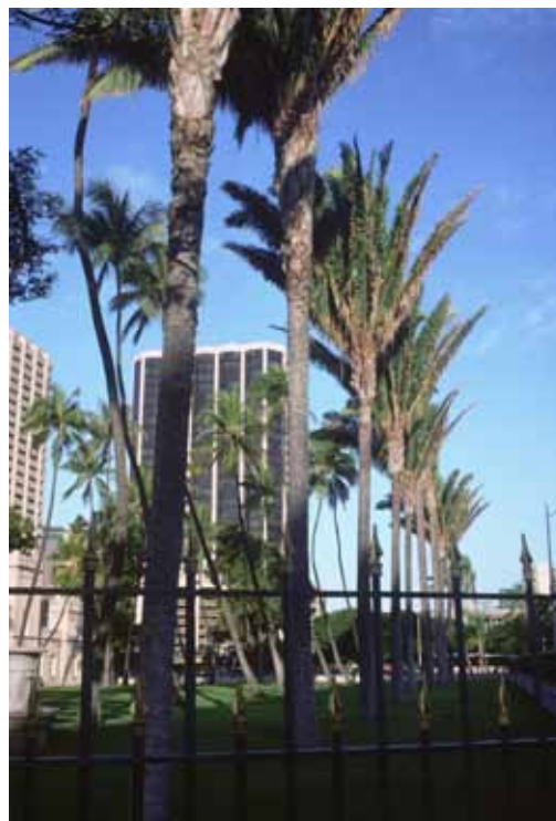
Attalea cohune (cohune palm)