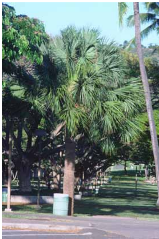
Sabal palmetto (palmetto palm)