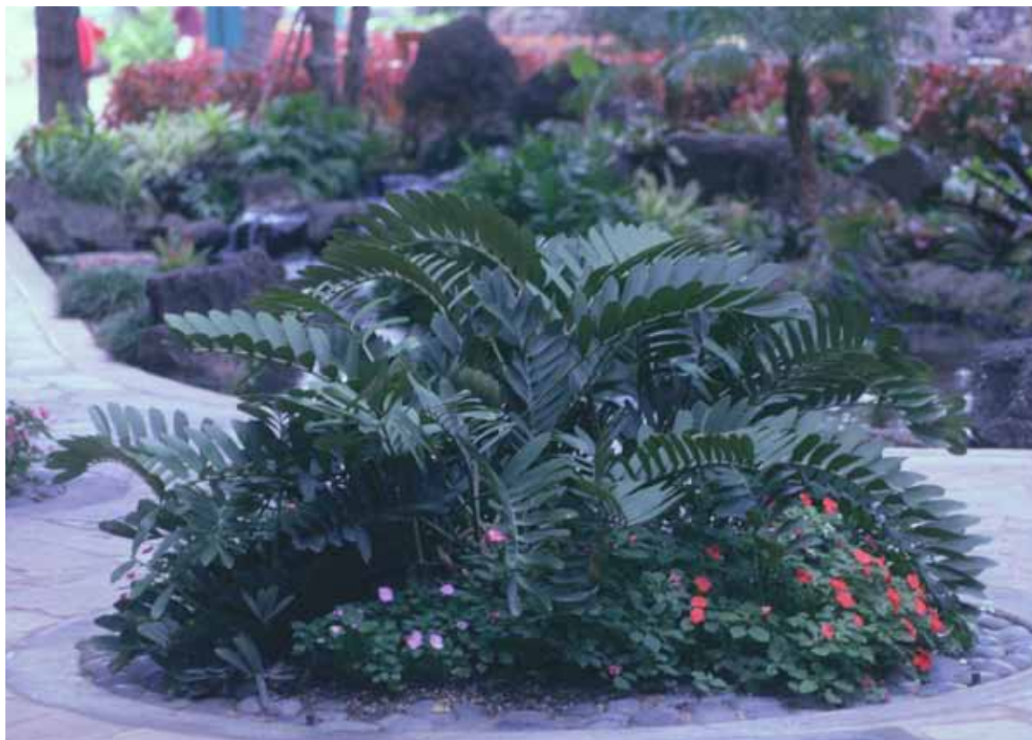
Zamia furfuracea (cardboard palm)