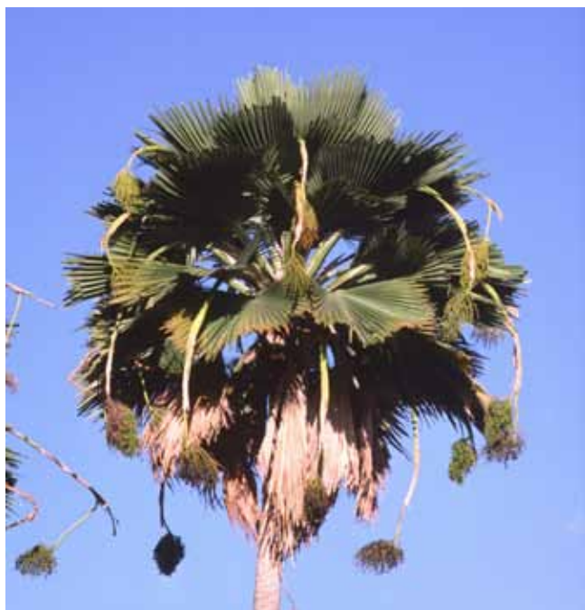
Pritchardia thurstonii (Masai palm)