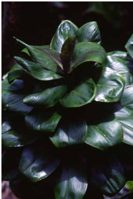
Cordyline fruticosa 'Green Spoon'