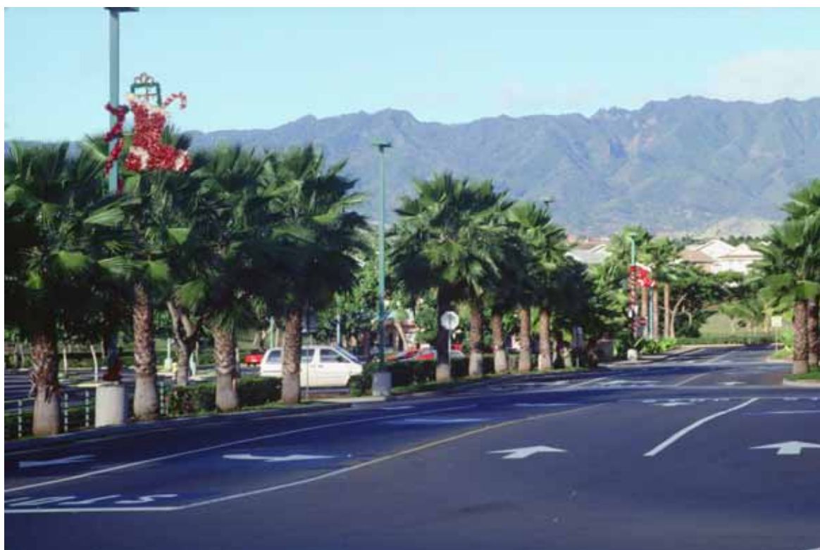
Washingtonia robusta (Mexican fan palm)