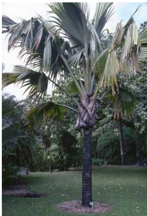
Lodoicea maldivica (coco-de-mer)