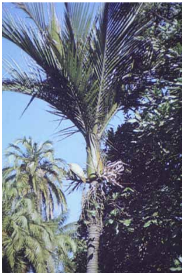
Rhopalostylis sapida (Nikau palm)