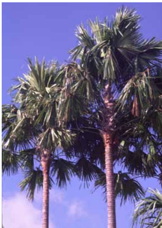
Livistonia rotundifolia (footstool palm)