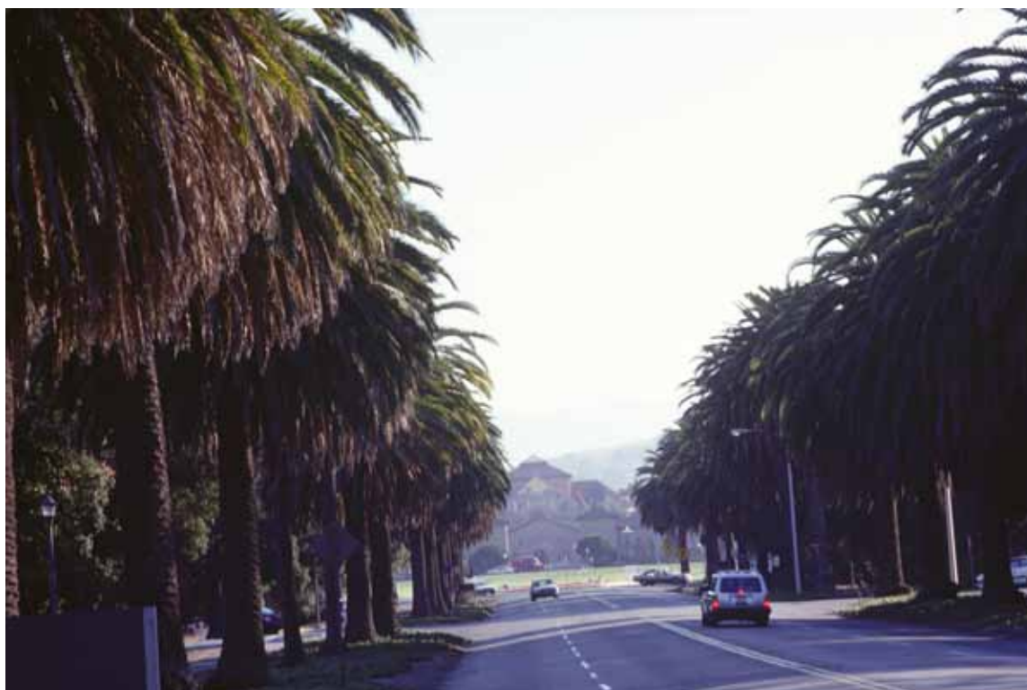
Phoenix canariensis (Canary Island date palm)