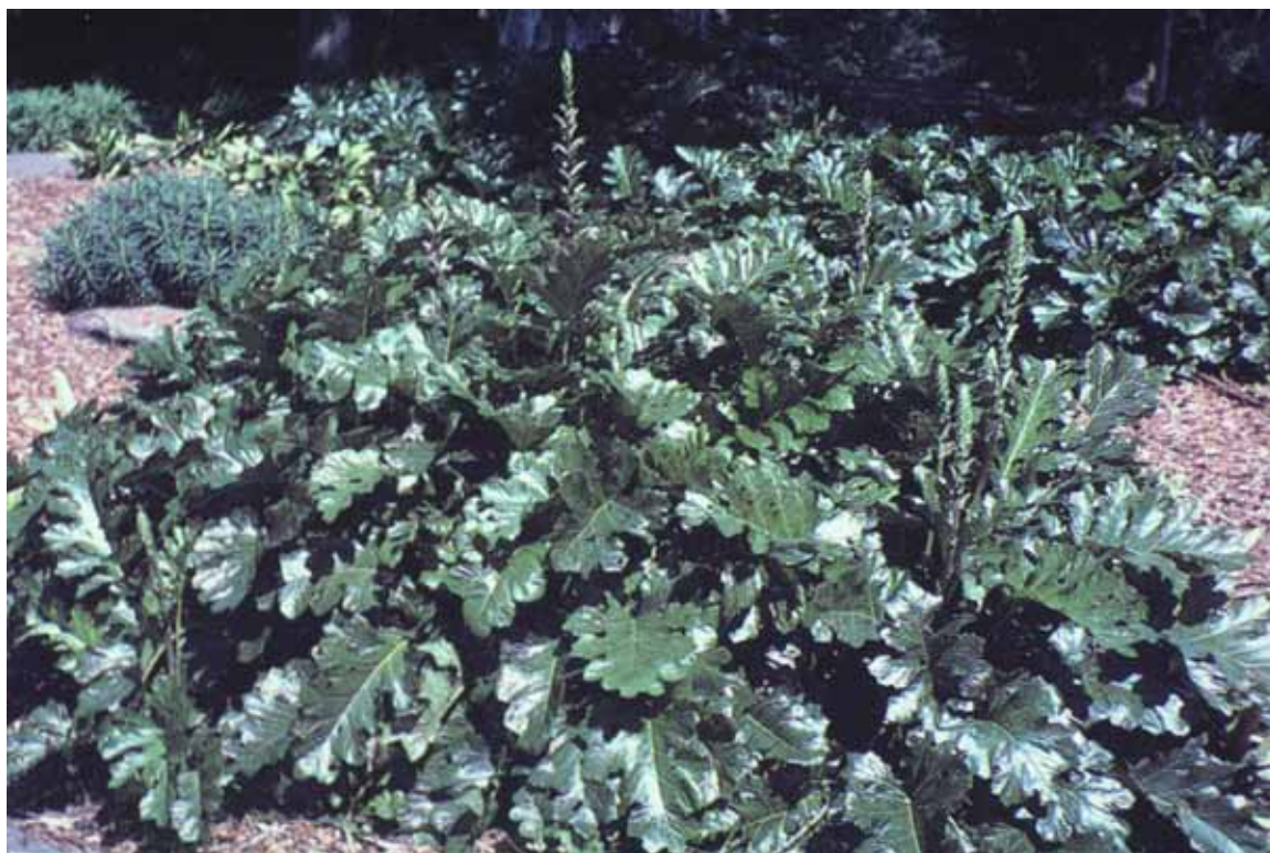
Acanthus mollis (Bear's breech)