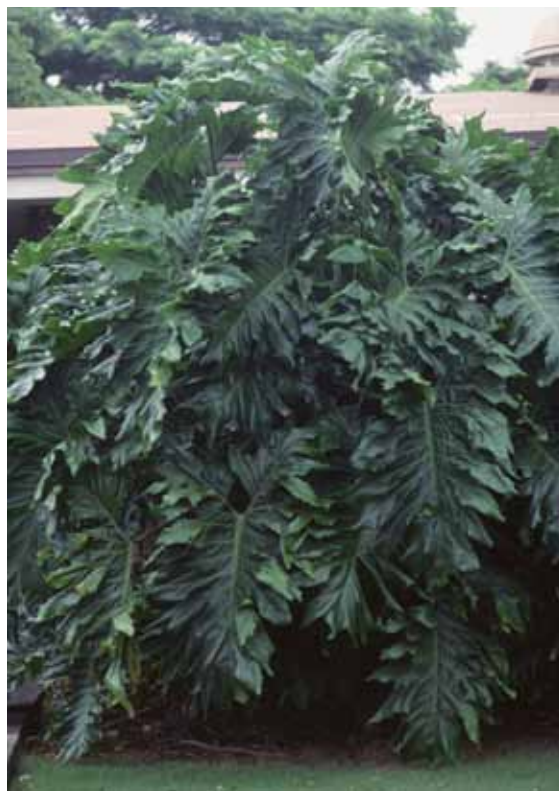
Philodendron bipinnatifidum (selloum philodendron)