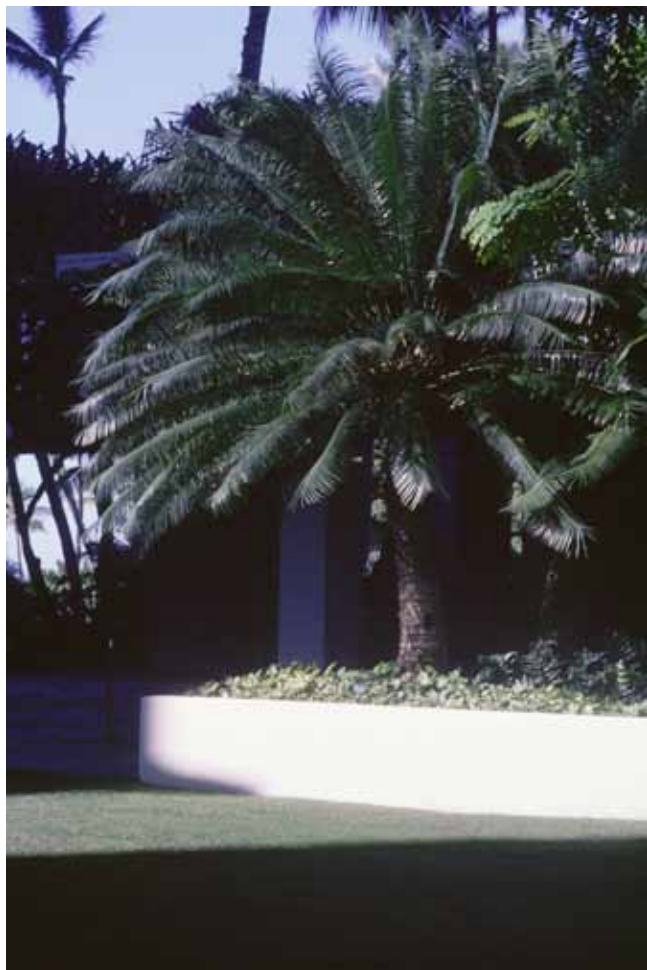
Cycas circinalis (queen sago)