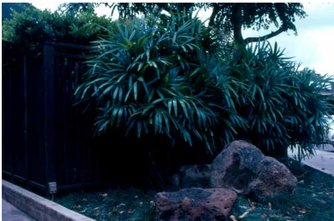
Rhaps excelsa (lady palm)