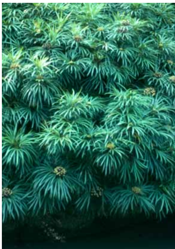
Osmuxlon lineare (Miyagos bush)