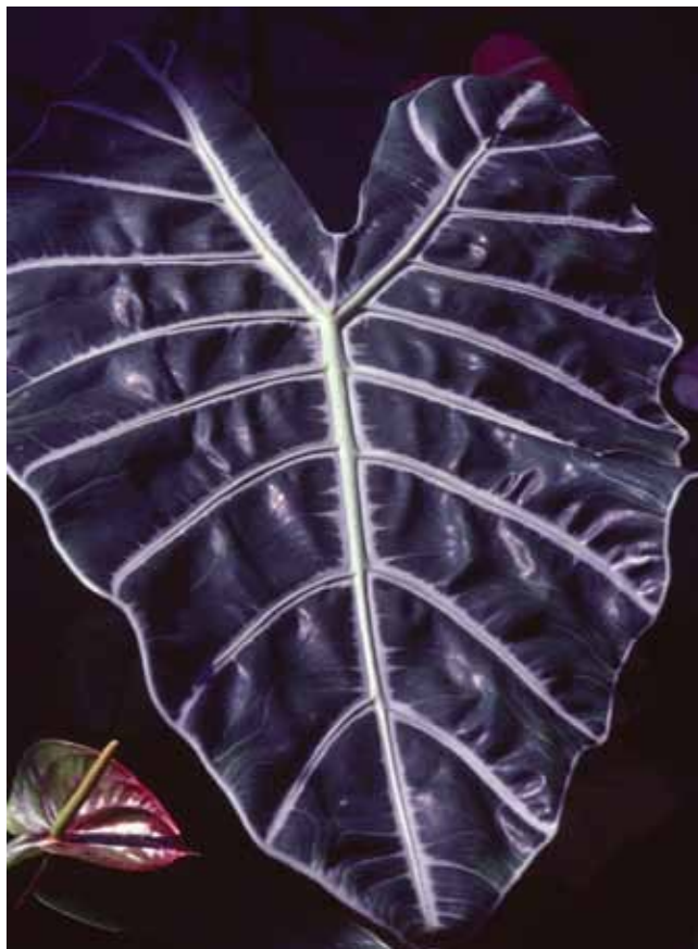
Alocasia spp. (alocasia)