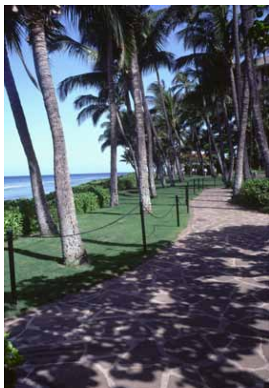
Cocos nucifera (coconut palm)