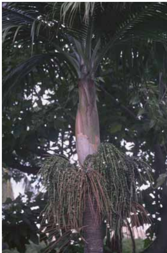
Dictyosperma album (princess palm)