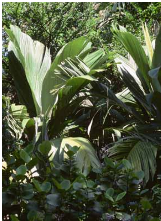
Pelagodoxa henryana (vahane)