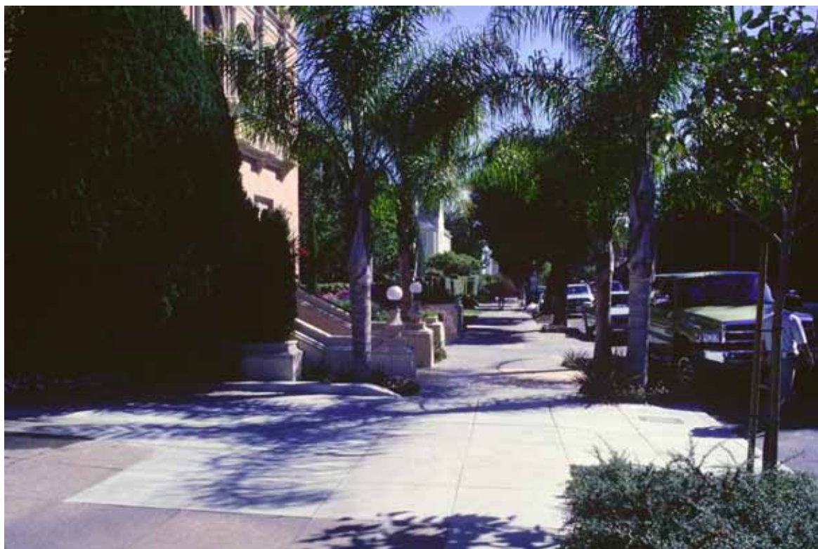
Syagrus romanzoffiana (queen palm)