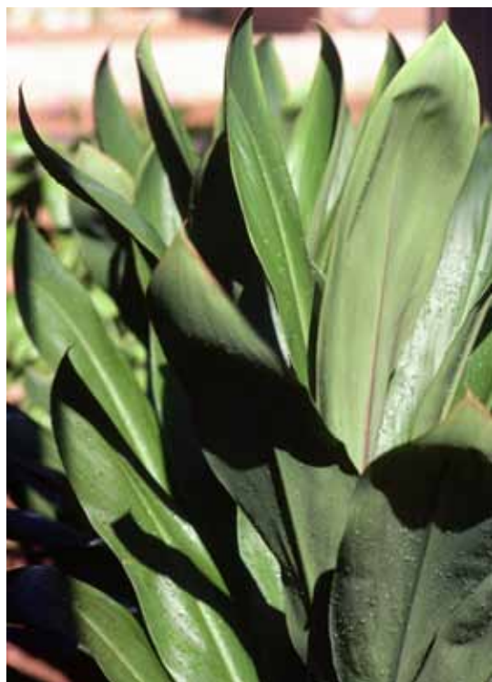
Cordyline fruticosa 'Kamehameha'