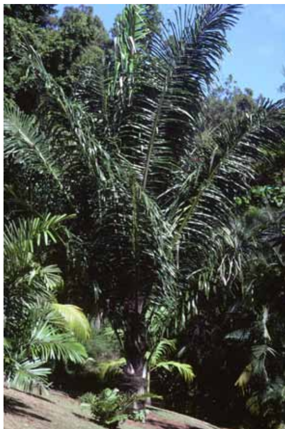
Arenga pinnata (sugar palm)