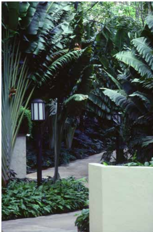
This view of Maunaluan Condominium, O'ahu, is dominated by traveler's palms.