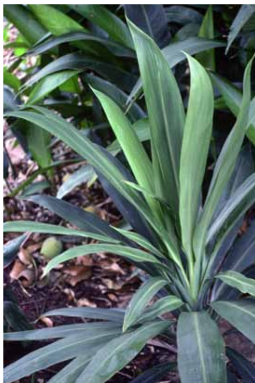
Cordyline fruticosa 'Green Flat'