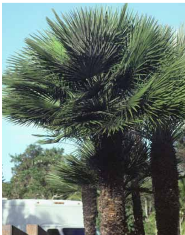
Chamaerops humilis (European fan palm)