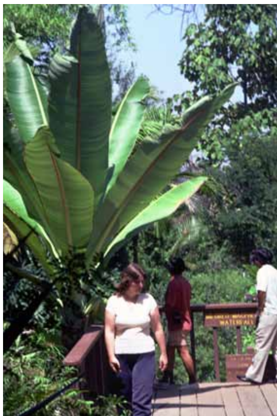
Ensete ventricosae (ensete banana)