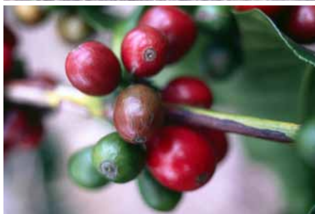
Coffea arabica (coffee)