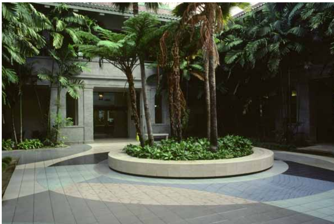
Ptychosperma macarthurii (Macarthur palm)