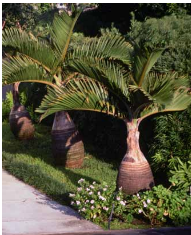
Hyophorbe lagenicaulis (bottle palm)