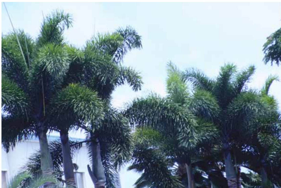
Wodyetia bifurcata (foxtail palm)