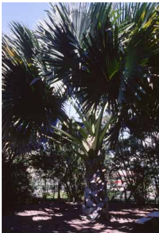
Corypha umbraculifera 'Talipot'