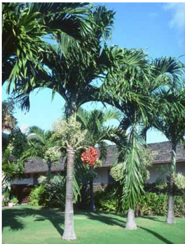
Veitchia merrillii (Manila palm)