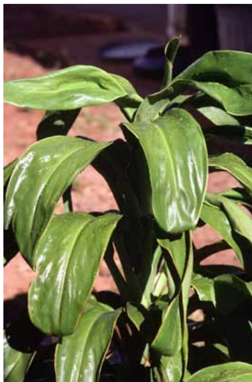
Cordyline fruticosa 'Floppy'