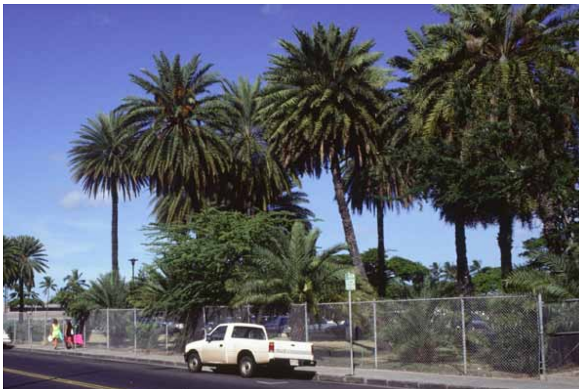
Phoenix dactylifera (date palm)