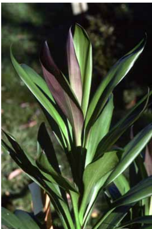
Cordyline braziliensis (Braziliensis ti)