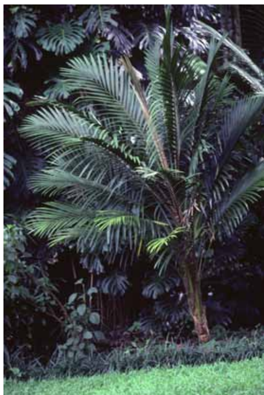
Laccospadix australasicus (Atherton palm)