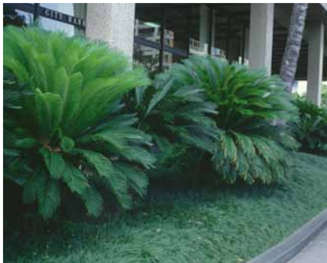
Cycas revoluta (Japanese sago palm)