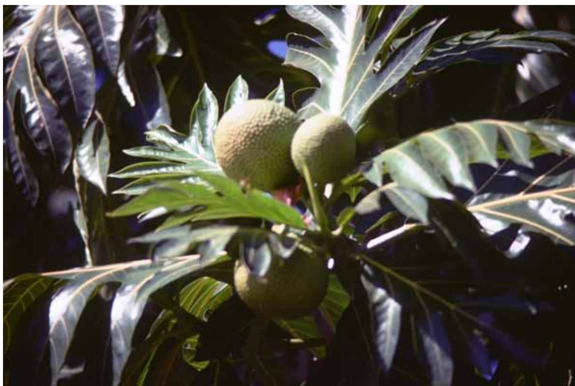
Artocarpus altilis 'Tahitian' (Tahitian breadfruit)