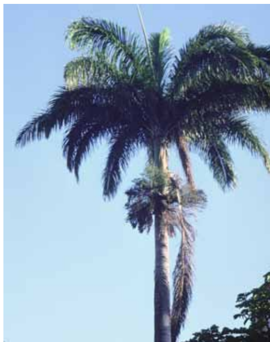
Roystonea oleracea (Caribbean royal palm)