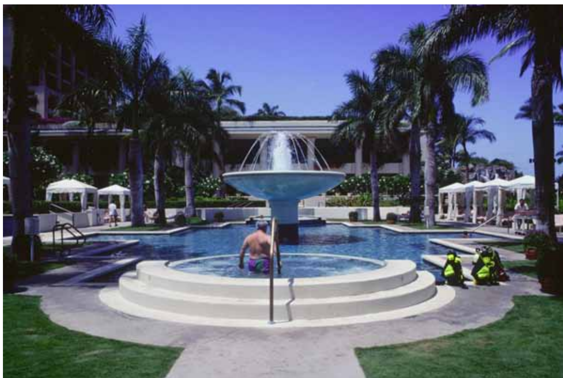
Roystonea regia (Cuban royal palm)