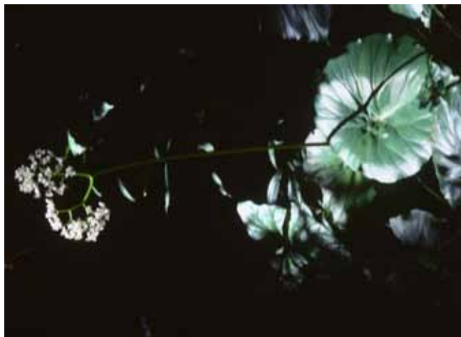
Begonia nelumbiifolia (lily-pad)