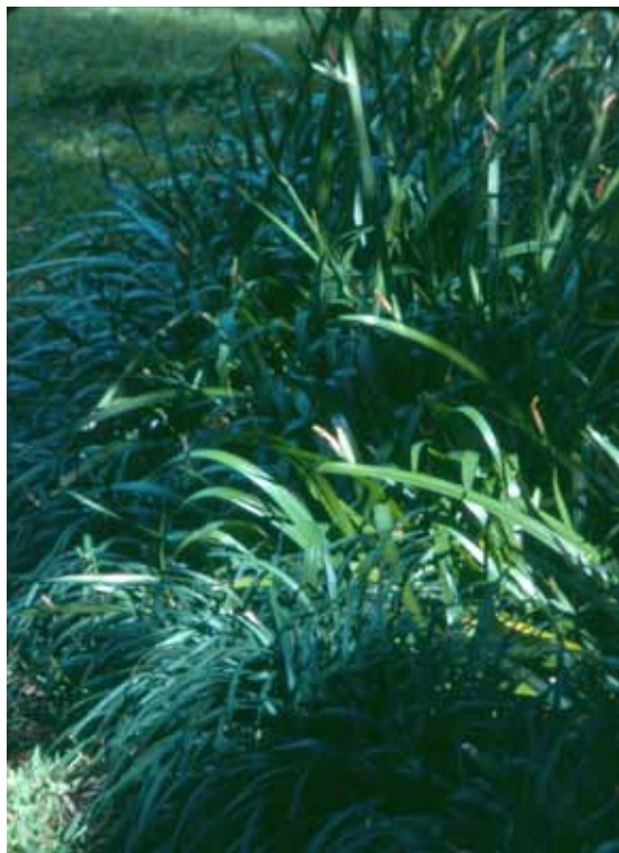
Neomarica gracilis (walking iris)