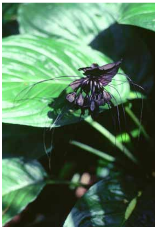
Tacca chantrieri (bat flower plant)