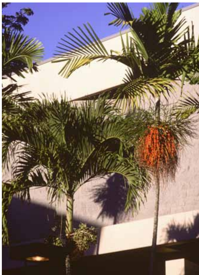
Ptychosperma elegans (solitaire palm)