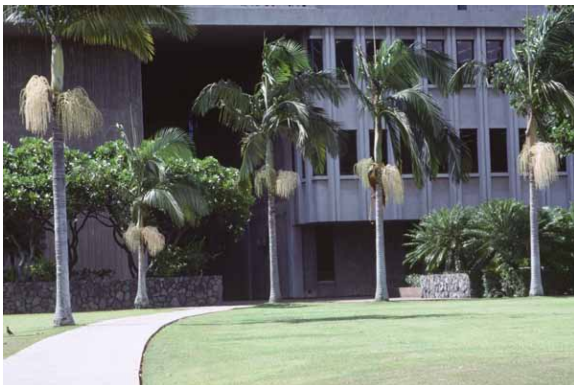
Archontophoenix alexandrae (alexandrae palm)