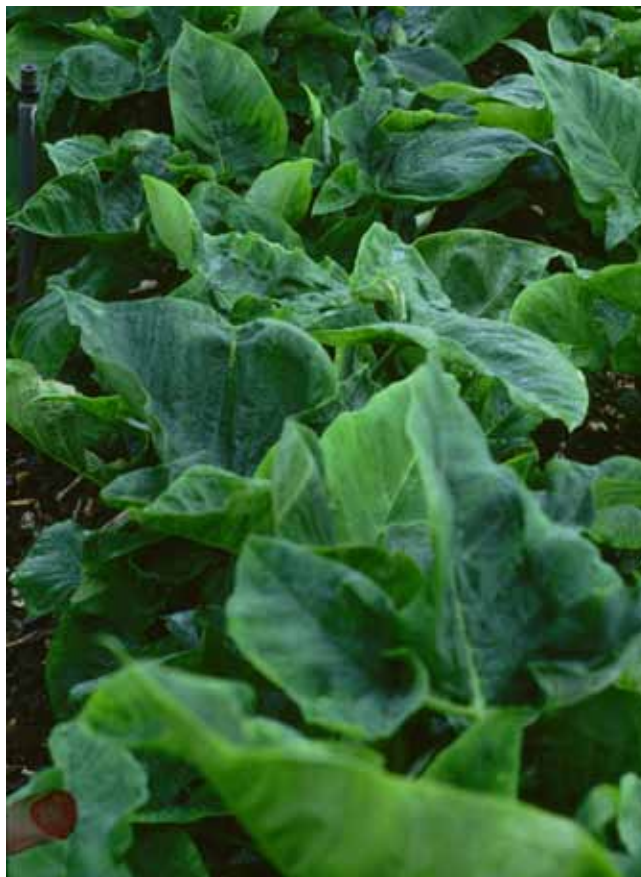
Xanthosoma brasiliense (Tahitian taro)