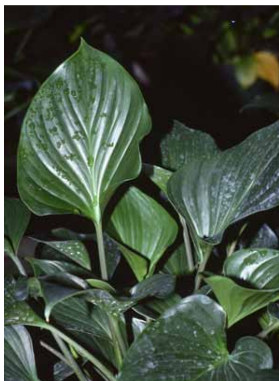
Alocasia cucullata (Chinese taro)