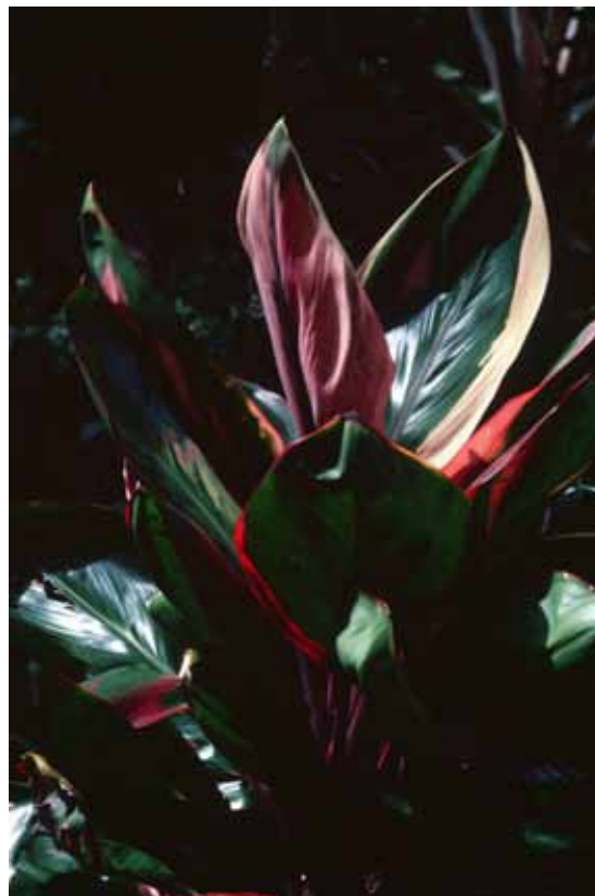
Cordyline fruticosa 'Tutu Elena'