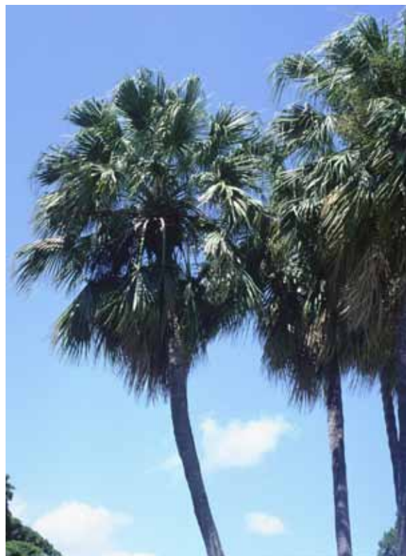
Livistonia chinensis (Chinese fan palm)