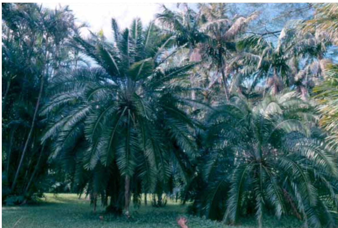
Phoenix rupicola (cliff date palm)