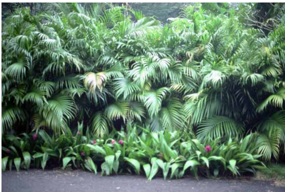
Chamadorea cataractorum (cascade palm)