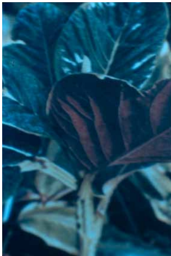
Piper magnificum (lacquerd pepper tree)