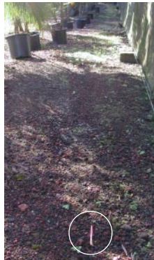
Near a shadehouse

3. Pick up the chopstick very carefully to avoid dislodging ants, and examine the ants on the peanut butter.