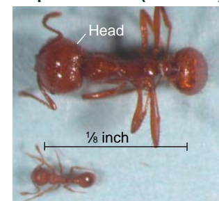
Little fire ant