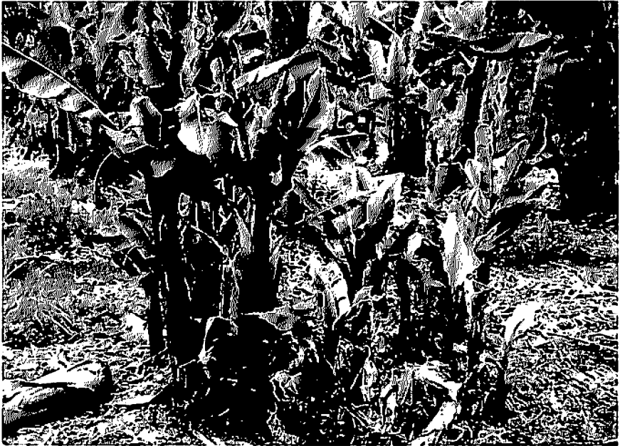
FIGURE 1. A mat of banana plants in Waimanalo showing typical symptoms of banana bunchy top disease.