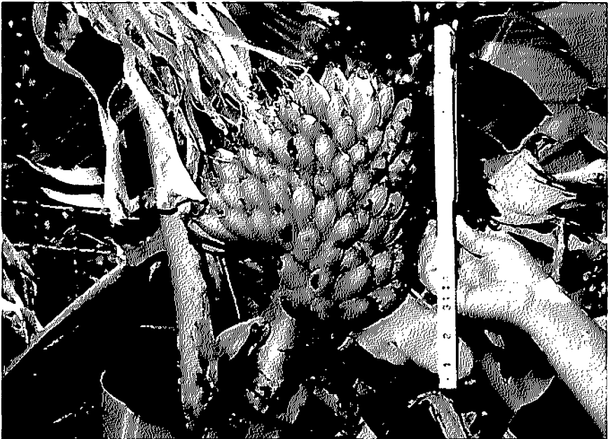
FIGURE 2. Stunted fruit on a banana plant infected with banana bunchy top disease.