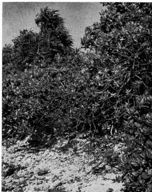
FIG. 2. Outer beach on Nomwin Islet, Hall Island, Caroline Islands, showing scrub vegetation, principally Scaevola frutescens .

Another important difference occurs between the vegetation of small or narrow islets and that of large land areas. The smaller the area of an islet the more extreme is the strand character of its vegetation, and the larger the area the more divergence is shown from this type. This divergence may be of different sorts, as in the