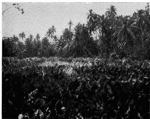
FIG. 4. Large excavated puraka patch surrounded by coconuts, showing sugar cane mixed with Cyrtosperma chamissonis , Nukuoro Islet, Nukuoro Atoll, Caroline Islands.

grove depressions" (see Fosberg in N. Y. Bot. Gard., Jour. 48(570): 128-138, 1947), or even fresh-water lakes, as on Washington Island. Here may be found sedges, grasses, and in the western Pacific, several plants of the mangrove formation. In the interior of this zone on the larger islands, the natives often excavate areas down to the water table, fill them with vegetable debris which decomposes to a muck, and therein plant taro ( Colocasia ), puraka ( Cyrtosperma ), and other cultivated plants which do not thrive on the normal atoll surface.