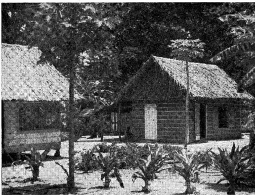
FIG. 6. Village scene on Ebon Atoll, Marshall Islands, showing Carica papaya , Crinum asiaticum , and other cultivated species. Papaya showing chlorosis.

On the sandy inner shore, or lagoon beach, is a narrow strip of scattered trees such as Cordia subcordata , Hernandia ovigera , Terminalia catappa , Barringtonia asiatica , Thespesia populnea , and, in rocky places, Pemphis acidula . Here also are such sand-loving herbs as Vigna marina , Triumfetta procumbens , Thuarea involuta , etc.