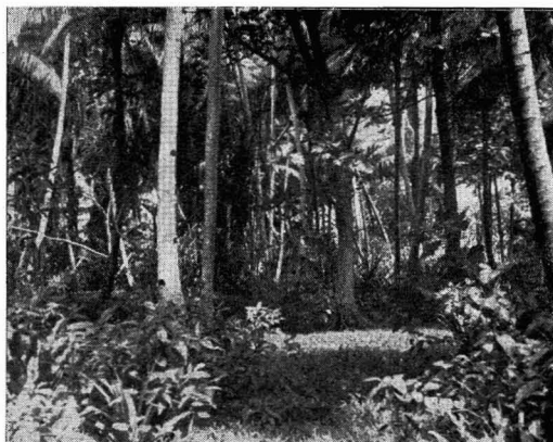
FIG. 3. Interior of Hare Islet, Kapingamarangi Atoll, Caroline Islands, showing undergrowth in coconut-breadfruit forest, with ground cover of Stenotaphrum subulatum .

In the interior of this zone there are frequently swales, marshes, ponds termed "man-