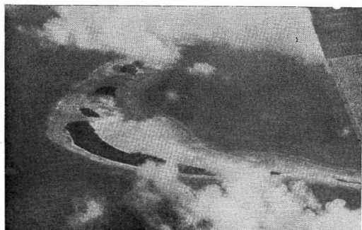
FIG. 1. Northwest corner of Mili Atoll, Marshall Islands, showing a number of small islets.

CORAL ATOLLS are flat rings of reef-rock and calcareous debris usually forming islets with an elevation of only a few feet above sea level. They are distributed throughout the tropical Pacific and Indian Oceans, except the eastern Pacific, with somewhat similar formations in the Atlantic, principally in the Bahama Islands.