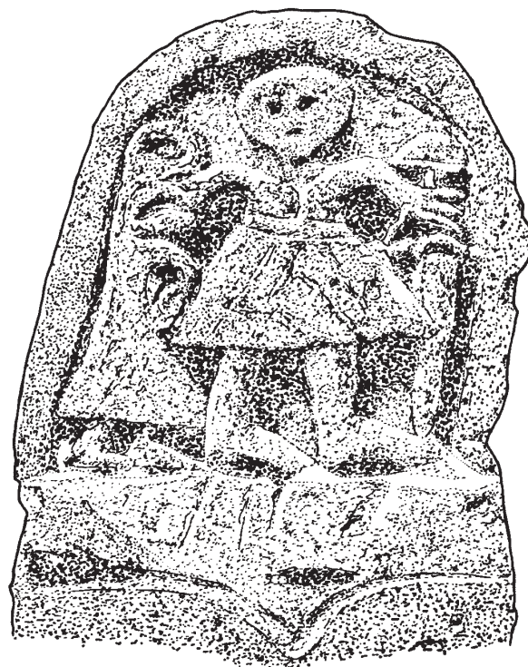
Figure 4. A tenth-century sculpture from Weston (Yorkshire) depicting a warrior with his sword in one hand, while with the other hand he grabs, pushes or perhaps protects a woman. On the reverse of this sculpture the warrior is depicted alone with his sword and battle-axe (height of section shown 22 cm)

The proliferation of stone sculptures in the tenth century derives from secular lords exercising a novel form of conspicuous display at what were frequently newly founded churches. Sculptures were probably sometimes, perhaps often, intended to serve as markers of the status of the whole family, and not simply of the individual over whose grave they were placed. At rural churches, in particular, it is rare to find more than one or two such monuments,