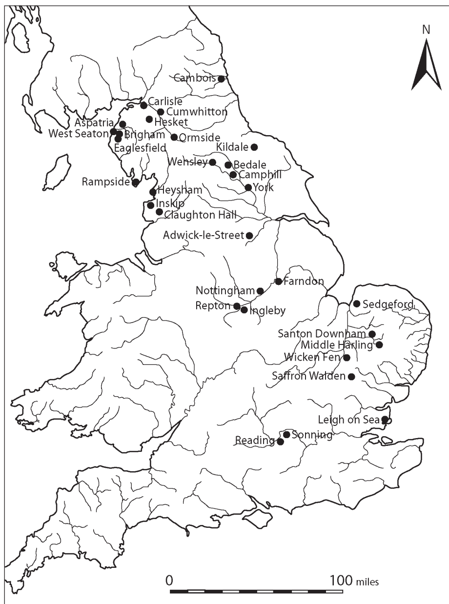
Figure 1. Map of Scandinavian burials. After J. D. Richards, Viking Age England (2nd edn, Stroud, 2000), fig. 63, with the addition of recently-discovered sites.

latch-lifter and a decorated bronze bowl from Adwick-le-Street (Yorkshire), and a female wearing a necklace of beads and silver pendants and accompanied by a knife from Saffron Walden (Essex). 19 In a small cemetery excavated recently at Cumwhitton (Cumberland) there were two female graves, one containing a jet bracelet and a belt fitting, and the other accompanied by an iron knife, a bead and a wooden chest with a weaving baton, although a pair of oval brooches founded prior to excavation by metal detectorists may also have originally formed part of this grave assemblage. 20 The discovery of a pair of oval brooches near to a sword at Santon Downham (Norfolk)