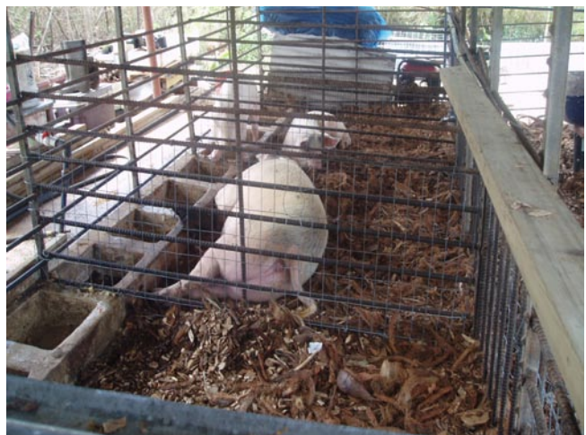
Sows appear comfortable on a bed of carbon materials (wood chips and coconut husks) on the island of Tinian.