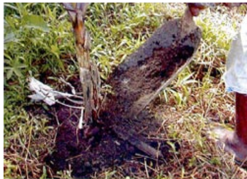
Direct application to appropriate crops is a simple way to use manure.