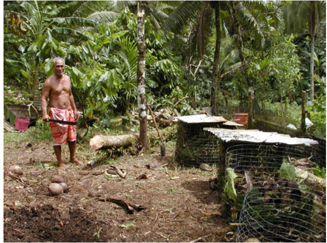
This farmer in American Samoa uses a series of covered wire composting units to regulate moisture levels in a high-rainfall climate.