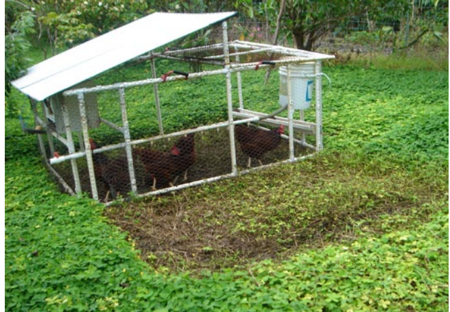
This grazing poultry cage is being used for laying hens. The open bottom allows the animals to graze on available forage (perennial peanut shown here) and insects.