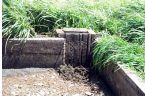
A solids separator allows for easier collection of manure solids by removing the liquid component.