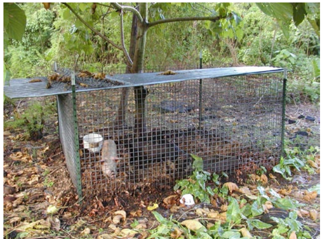
This portable dry-litter pen is set up around a tree for additional shade.