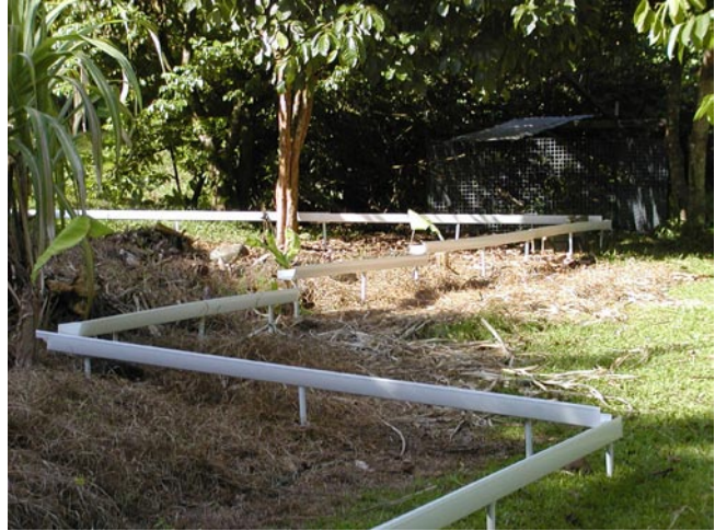
Rain gutters are used in this low-cost irrigation system, which distributes pen washdown water to target cropping area.