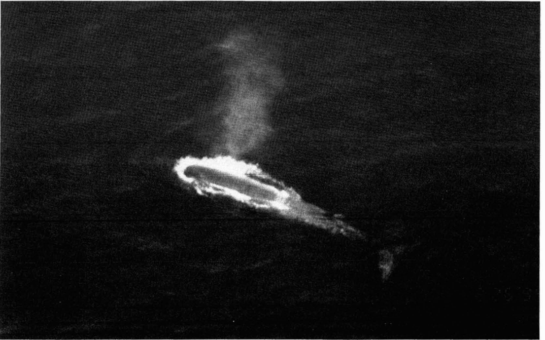
FIGURE 1. Fin whale sighted in waters north of Kaua'i, Hawai'i (26 February 1994, 22° 31.5' N, 159° 44.5' W). Shown with accompanying adult humpback whale (above) and after breaking surface to blow (below).