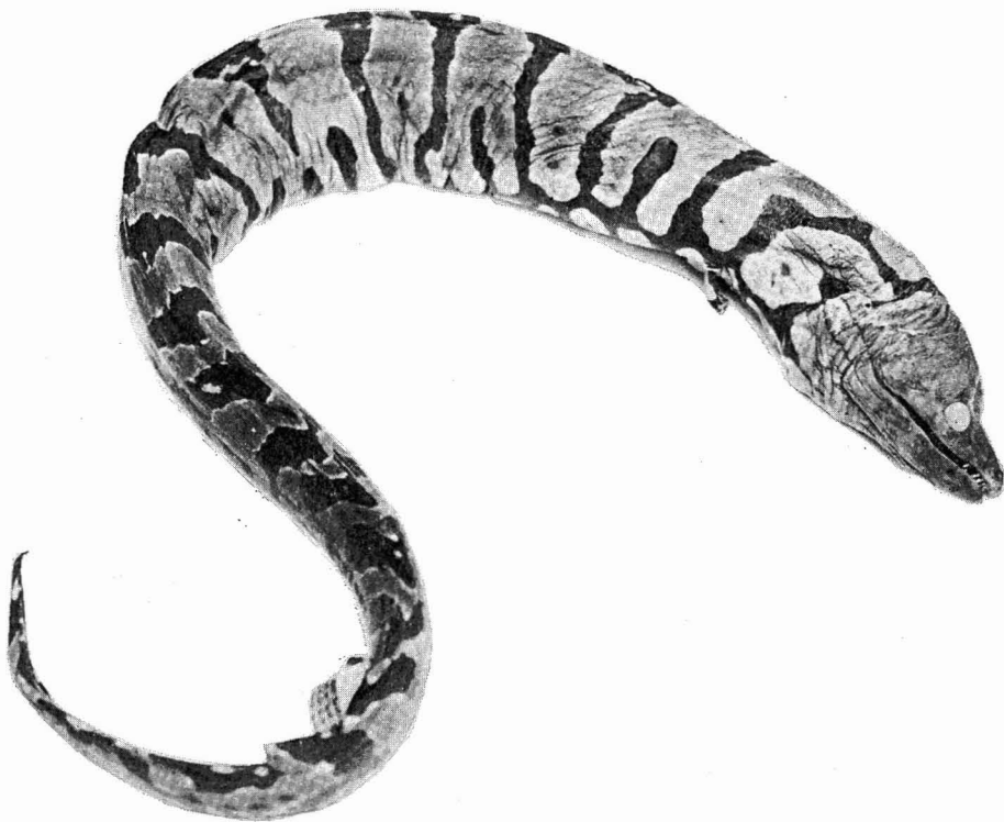
FIGURE 2. The PNG specimen of Gymnothorax pikei , registration number FO1997. Total length is 807 mm. Registration tag is attached.