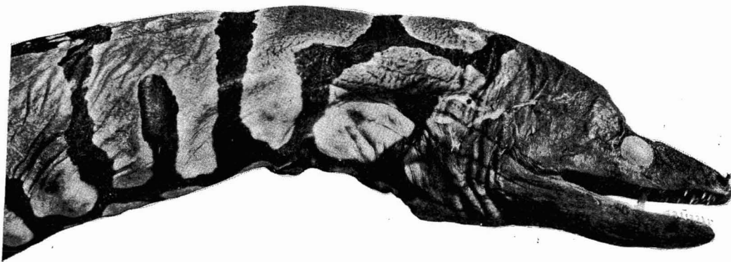
FIGURE 3. Head of PNG specimen of Gymnothorax pikei , registration number FO1997. Mouth has been propped open.