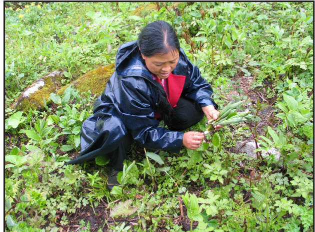
Figure 4. Lisu woman.

Collection sites are chosen according to their accessibility and abundance of species. The young, tender Maianthemum shoots are gathered by hand, collected in baskets and bundled at home. The bundles can be stored for a few days. In Nujiang Prefecture, only very young shoots are collected. As soon as the leaves start spreading, the shoots are not harvested anymore, since bitterness increases. Instead, younger shoots in habitats at higher altitudes are sought. In Diqing Prefecture, however, shoots with up to five developed leaves are collected. In Weixi, “small” and “big” zhuyecai are differentiated. “Small” zhuyecai includes young shoots of M. forrestii (W.W.Sm.) LaFrankie, M. henryi , M. purpureum , and M. tatsienense , which are collected in April and May, before the preferred “big” zhuyecai , M. atropurpureum , is available.