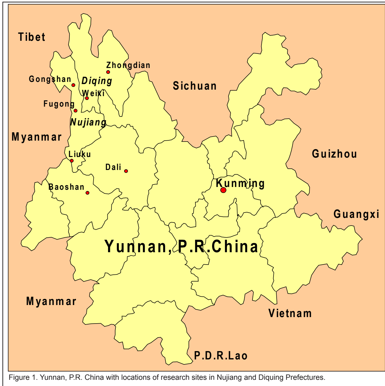
Figure 1. Yunnan, P.R. China with locations of research sites in Nujiang and Diqing Prefectures.

while the northern parts are affected by the colder, moister climate of Southeast Tibet. The vegetation ranges from subtropical rainforest at the lowest altitudes, subtropical evergreen forest and pine forests, to alpine forest, and alpine meadow.