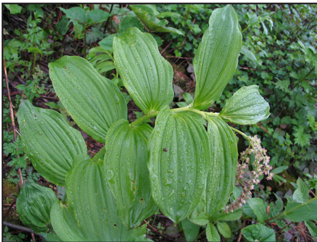
Figure 2. Maianthemum atropurpureum .