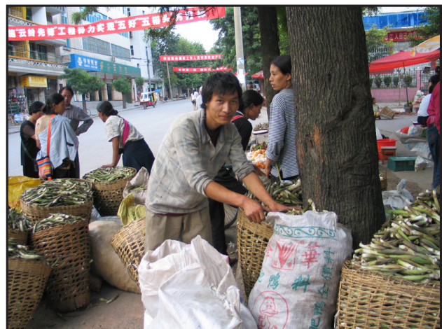
Figure 4. Market in Fugong.

The collectors in Gongshan, who also deliver the harvest by truck, mainly sell it in the local market, more rarely to retailers and wholesalers. During peak seasons up to one ton per day can be sold locally, which is usually done by the wives or mothers of the collectors. Consumers are local people and restaurateurs. In Zhongdian and Weixi all