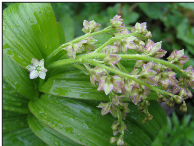
Figure 1. Maianthemum atropurpureum .

Fieldwork for this study was conducted in two prefectures of Northwest Yunnan, Nujiang and Diqing, respectively (Figure 3). Nujiang Prefecture has an elevation of 750-5100 m and is located in the uttermost northwest of Yunnan, bordered by Tibet in the north and Myanmar in the west. Lisu are the dominating ethnic group, practicing mixed and swidden agriculture for subsistence (Huang et al. 2004). To represent the prefecture, three county capitals were chosen as field sites, i.e., Gongshan (98° 39' E; 27° 45' N; 1300 m) in the north, Fugong (98° 51' E; 26° 55' N; 1200 m) in the center, and Liuku (99° 51' E; 25° 51' N; 880 m) in the south of the prefecture. The southern regions are characterized by a sub-tropical climate,