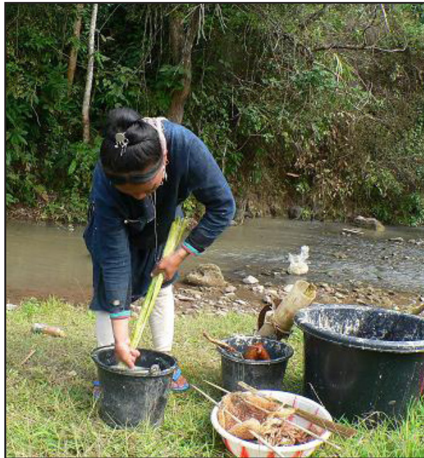
Figure 8. Squeezing sap out of kok tieng saa bark.