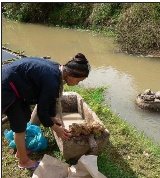
Figure 3. Large pieces of bamboo being removed from a suspension of bamboo fibers in water.

When the bamboo has been crushed into a paste, it is placed in a larger wooden or plastic container to which stream water is added. It is then mixed well with a stick or by hand to suspend the particles of bamboo in the water. Large pieces of bamboo that still remain are discarded (Fig. 3). Smaller pieces are removed either by hand or with the prongs of a bamboo fork (Fig. 4). To this water is added a gluing agent, the sap of the tree kok tieng saa .