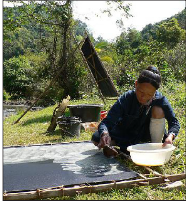
Figure 13. Uniformly spreading paper slurry to ensure that the resulting paper has no holes.

The bamboo paper is left in the sun to dry for a few hours (Fig. 14). When it is dry, it is carefully peeled off the cloth