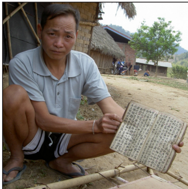
Figure 16. A household head shows one of the books, which he said is several decades old and he inherited from his grandfather.

The third and probably most demanding use of bamboo paper is for decoration of ceremonial altars and the paper curtains used during religious ceremonies. Huge paper curtains are erected by households for a memorial ceremony for their ancestors (Lemoine 2002). This ceremony lasts for three full days and nights. All kin, as well as virtually all the fellow villagers, are invited to participate at least in the great collective meals. One hundred and fifty bamboo paper sheets might be used during one such