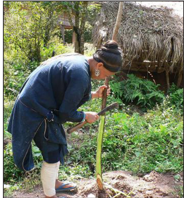
Figure 5. Peeling bark off of a branch of the tree kok tieng saa .

A branch of the tree kok tieng saa has its outer bark peeled off (Fig. 5). The inner bark is then washed, and beaten with a stick to soften it and facilitate its removal from the stem (Fig. 6). The hard stem is discarded and the bark is further beaten soft (Fig. 7). The bark is then washed with water and its sap is squeezed out by hand (Fig. 8). The sap of the kok tieng saa is viscous, and glues together the particles of bamboo in the water.