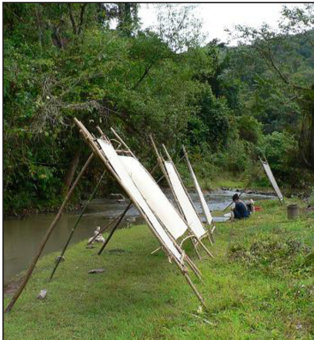
Figure 14. Fresh bamboo paper drying in the sun.

(Fig. 15) and folded for storage. Each piece of paper can be sold for 3,000 to 4,000 kip (US$0.30 to 0.40). However, many households do not purchase, but produce their own paper.