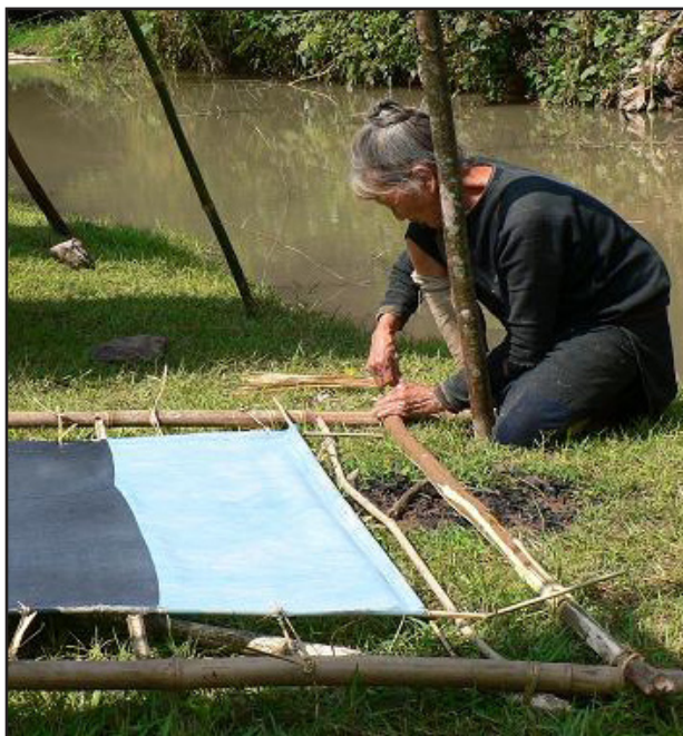
Figure 10. Cloth on a bamboo frame used for paper production.

The cloth is first washed in the river (Fig. 11). After this, the liquid slurry, consisting of the bamboo particles and