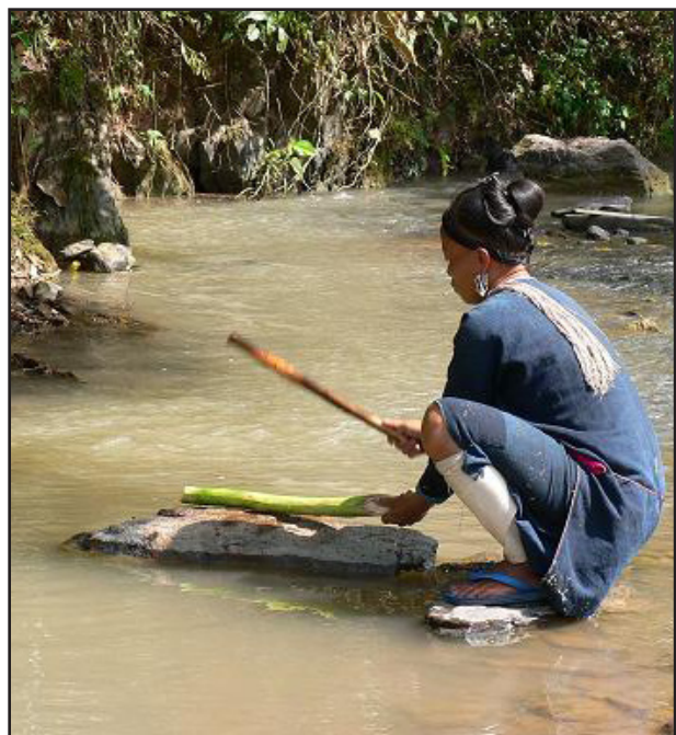
Figure 6. Beating the inner bark of the kok tieng saa tree in order to soften it.

The two liquids (one with the sap from the kok tieng saa tree and one with the bamboo particles) are mixed in appropriate proportions to make the paper slurry. Slurry viscosity is verified with the help of a scoop (Fig. 9). If the liquid is not sufficiently viscous, more liquid from the kok tieng saa is added. The resulting liquid is then ready to be spread over a black woven cloth, tightly drawn over a bamboo frame.