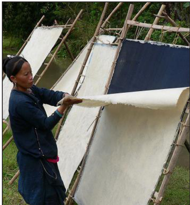
Figure 15. Peeling off freshly made bamboo paper from the drying rack.