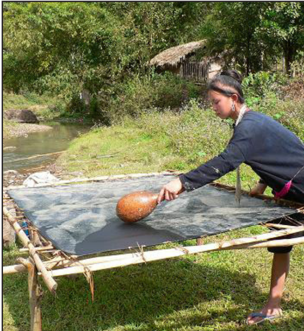
Figure 12. Gourd scoop being used to spread the paper slurry.

the sap, is spread over the woven cloth with a scoop (often made from a gourd) (Fig. 12). All gaps are carefully filled to make sure that the paper has no holes (Fig. 13).