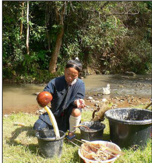
Figure 9. Checking the viscosity of the paper slurry with a scoop.

Every household produces woven cloth from home-grown cotton. While in the past each household removed the seeds from the fiber by hand, a very time consuming activity, one household in Nam Dee village now does this with a machine for all Lanten in Luang Namtha province. Nevertheless, in general, every household makes the cotton yarn and weaves its own cotton cloth, mainly for the production of clothes. The cloth is woven in narrow strips