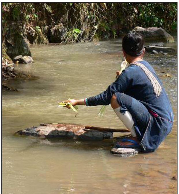
Figure 7. Discarding the stem before further beating the bark.