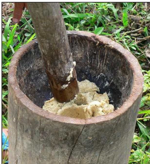
Figure 2. Softened bamboo being crushed with a mortar and pestle.

be burned, and so exchanged with the unseen, the spirit part of the phenomenal world.” Only bamboo paper can be used for the religious ceremonies, and while the ceremonies are all carried out by men, the production of bamboo paper is the realm of the women. This is the contribution of the women to the ritual life, together with preparing the food for the men who carry out the rituals, and their guests.