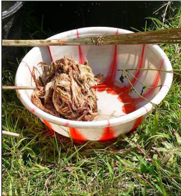
Figure 4. A bamboo fork used to remove small pieces of bamboo.