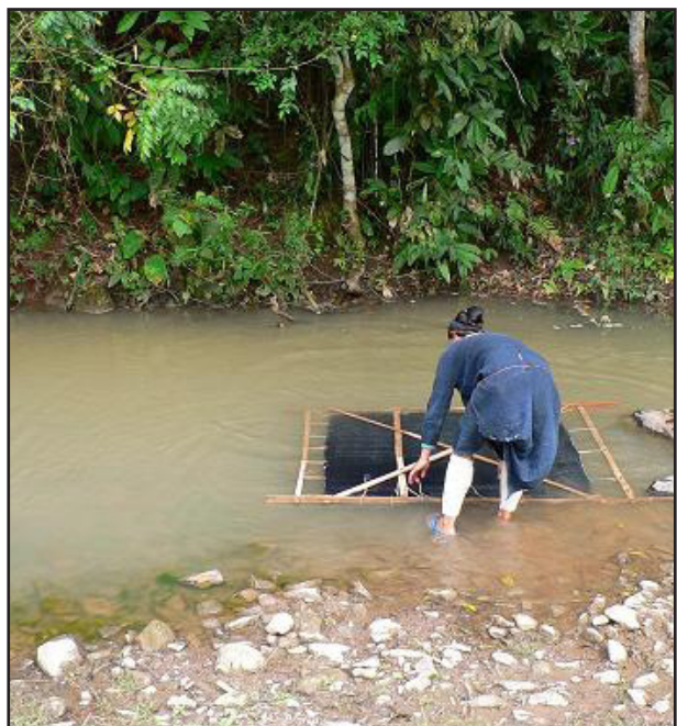
Figure 11. Washing the cloth used for paper making.