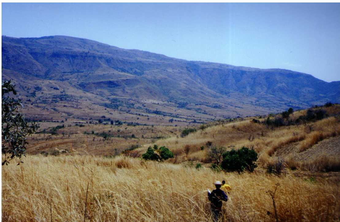
Figure 3. Plot sampling for grass assessment during the Tombo thatch grass ecological survey.

Intensive grass commercialisation was adopted as one of the management strategies. The grass was mainly harvested between June and October. The grass cut with a sickle and then combed with a brush. On average the length of the grass cut was 1.6 m. Grass cutting differed between men and women. As compared to men women cut shorter grass, spent more time on travelling and cutting and produced more bundles of the finished product (six times as much). Of the 9 067 bundles harvested in 1999, 72.8% were H. dissoluta , 10.9% H. cymbaria and 16.3% H. hirta . The average size of a bundle was 165 +/- 24.1 grass stocks. On the other had men claimed to get more money than women from their sales. The household income from grass sales ranged from nothing to US$60.00 in the 1999 season. To date there are about 300 individuals involved in commercial harvesting of grass (Figure 4).