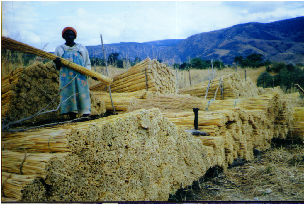
Figure 4. Thatch grass processing for marketing in Tombo.