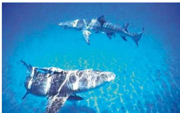
Figure 13.1 Compared to bony fish, sharks live for a long time, grow slowly and produce few young. As a group, they have relatively slow rates of evolutionary change and are sensitive to intense human pressures. Once depleted, shark populations can take considerable time to recover.

This reproductive strategy also makes sharks vulnerable to unnaturally high levels of adult mortality. A K-selected life history strategy means that the number of young produced is closely linked to the number of breeding adults. Thus, as the number of adult sharks declines, the number of new recruits entering the population may also decline. As a result, shark populations can be reduced relatively quickly and once depleted, may take a long time to recover. For example, demographic analyses of sawfish populations in the western Atlantic suggest that even if effective conservation measures are introduced, recovery of these populations could take several decades 64 .