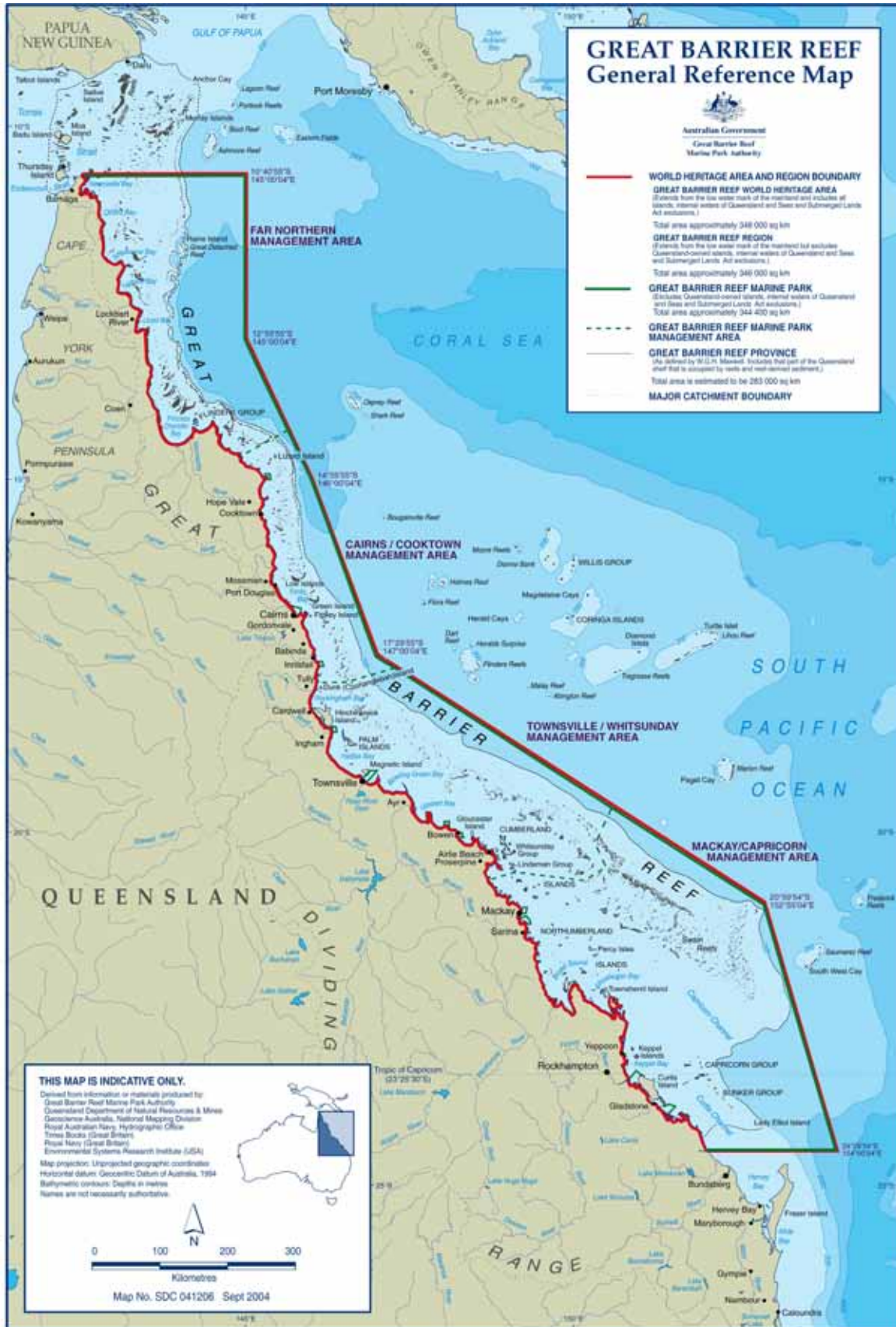
FIGURE 1. MAP OF THE GREAT BARRIER REEF MARINE PARK AND GREAT BARRIER REEF WORLD HERITAGE AREA BOUNDARIES