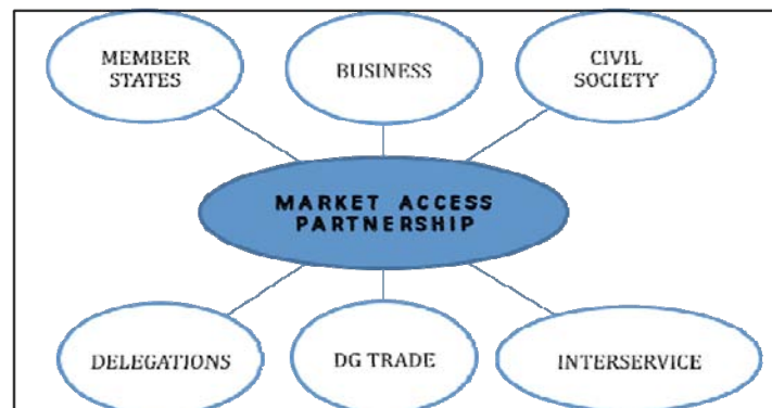
Figure 1: Participants in the Market Access Partnership 22

participating not only through the Council and their Economic Counsellors in the 'Article 133 Committee' but also through their embassies in third countries. Finally, business is mostly represented through business associations. In some cases, the Market Access Partnership is also open for participation of representatives of civil society. In ideal circumstances, all stakeholders enumerated above act jointly through the committees and teams provided by the platform of the Market Access Partnership in order to detect, analyse and remove trade barriers in third countries (see Figure 1).