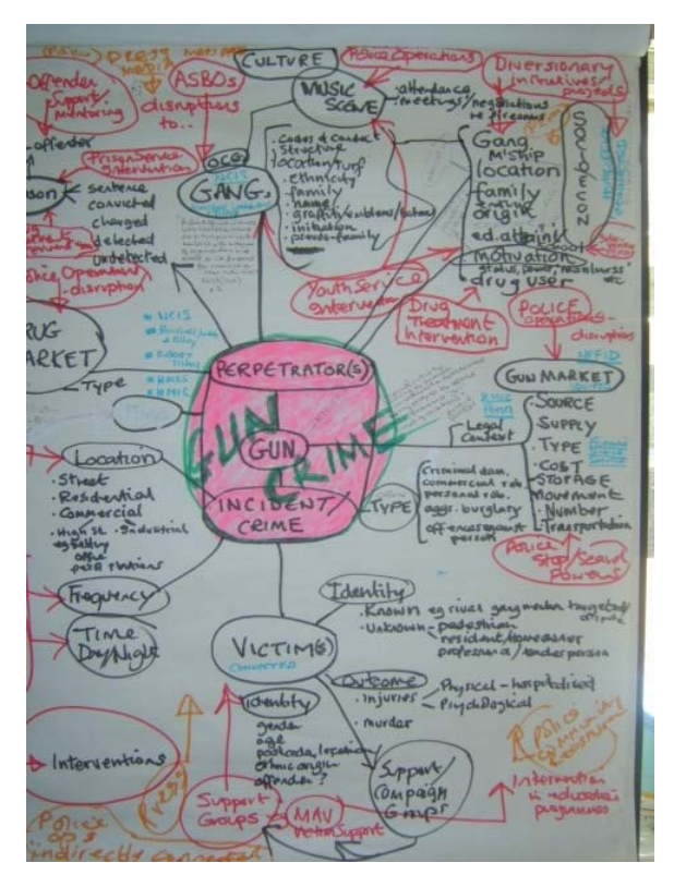
Fig 1. Example of a hand-drawn mind-map