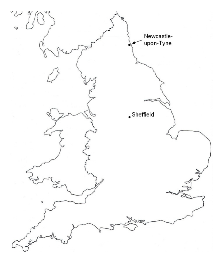
Figure 1: Outline map of England, showing the locations of Newcastle and Sheffield<sup>3</sup>