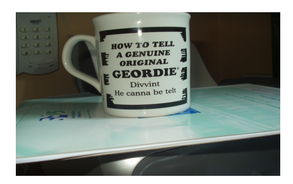
Figure3: Geordie Mug

The mug illustrated in Figure 3 tells us how we can know a 'Genuine original Geordie' The punch-line 'divvint he canna be telt' ('Don't: he can't be told') alludes to the stereotypical intransigence of the 'Geordie': 'he can't be told' means 'he won't be contradicted'.