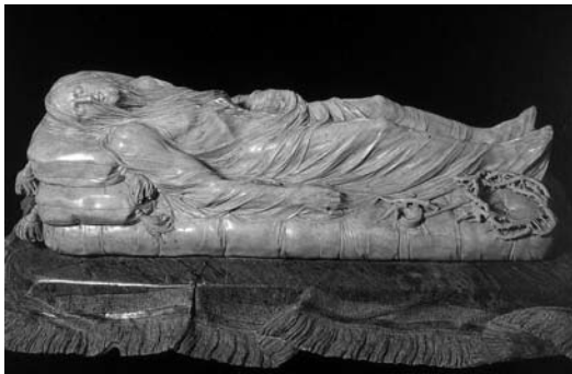
Figure 10: Giuseppe Sanmartino, Shrouded Christ , 1753. Cappella Sansevero de' Naples.