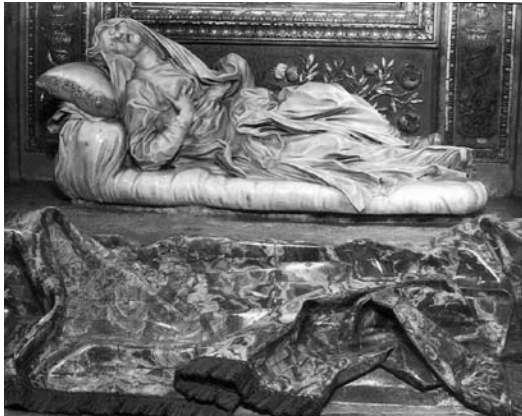
Figure 9: Gianlorenzo Bernini, Blessed Ludovica Albertoni, 1674. S. Francesco a Ripa, Rome.