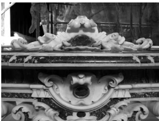
Figure 11: Balustrade of the high altar in the church of the Certosa of San Martino, probably by Tagliacozzi Canale, Giuseppe Sanmartino, and Filippo Belliazzi, Naples.

not an art of structures but of textures. 77 Deleuze understands folds as liberated by a go-between from 'merely reproducing the finite body' – these go-betweens, placed between clothing and the body, are the Elements. The livid drapery of St Teresa's habit is alive with fire that spreads through her body, including its surface. 78 Indeed, Teresa's body – apart from its telling extremities, her head, hands, and feet – disappears inside the flames of folds; her body is burned up. The cost of her experience is the loss of subjectivity.