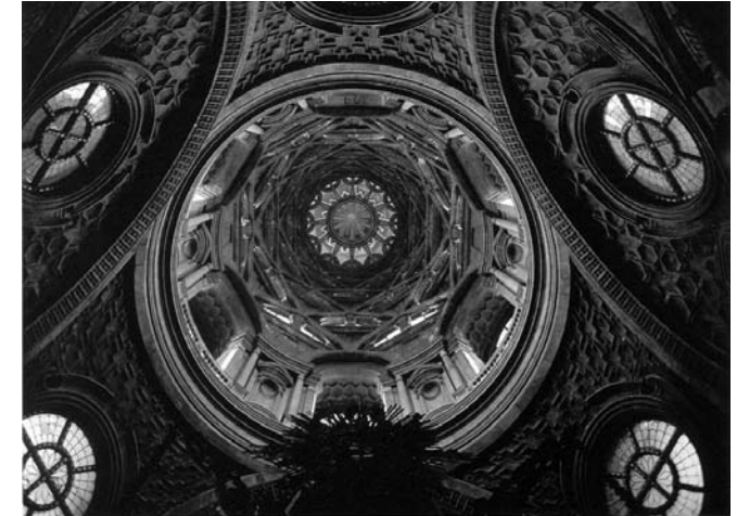
Figure 2: Guarino Guarini, Cappella SS. Sindone, Turin, 1667-90. View into dome.

In the Encyclopédie Méthodique: Architecture (1788-1825), aimed in part at producing an appropriate public audience for emerging public architectures, Quatremère de Quincy seems to conceive of baroque as its nemesis, the product of the merely curious (as opposed to the connoisseur). He defines “baroque” in architecture as a nuance of the bizarre. ‘It is, if you like, its refinement, or, if it were possible to say so, its abuse.’ 8 For him the essence of the baroque is its excessive bizarreness, its unrestrained eccentricity: ‘What severity is to the prudence of [good] taste, the baroque is to the bizarre. That is to say, it is its superlative.’ It is not simply eccentric, but bizarrerie or ridiculousness pushed to the extreme. 9 Quatremère thus distinguishes between “baroque” and “bizarre”, the one being the excess of the other: Borromini, whom Quatremère regards as motivated mostly by jealousy of Bernini, ‘provided the greatest models of bizarrerie ’, while Guarini passes for ‘the master of the baroque’; and he cites Guarini’s SS Sindone Chapel in Turin as the most striking example of the taste (Fig 2). 10