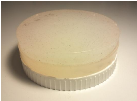
Fig. 2: The dual layer silicon sample

The task was designed to simulate needle handling during anesthetic needle insertion. Tissue was simulated using silicon samples (Figure 2). The participants were instructed to perforate the silicone using an anesthetic needle (Figure 3) until they reached the middle layer of the dual-layered gel samples. Depending on the experimental conditions, the task was performed with or without a visual aid which consisted of a real-time display for the forces applied by the participants on the needle.