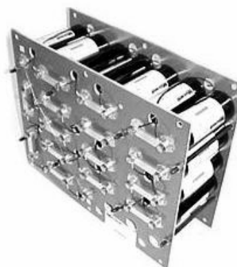
Fig. 4. Internal design of high-voltage (ten voltages) supercapacitor, assembled from number of low-voltage elements

One more variant of the solution of this problem for substations with DC auxiliary voltage is to not use an individual capacitor for each MPR, but rather a special "supercapacitor" capable of feeding a complete relay protection system set together with conjugate electronic equipment within several seconds. Such supercapacitors are can already be found on the market under brand names such as: "supercapacitors", "ultracapacitors", "double-layer capacitors", and also "ionistors" (for Russian-speaking technical literature). There are electrochemical components intended for storage of electric energy. On specific capacity and speed of access to the reserved energy they occupy an intermediate position between large electrolytic capacitors and standard accumulator batteries, differing both from one and the others in their principle of action, based on redistribution of charges in electrolyte and their concentration on the border between the electrode and electrolyte. Today, supercapacitors are produced by many Western companies (Maxwell Technologies; NessCap; Cooper Bussmann; Epcos; etc.) and also some Russian enterprises (ESMA; ELIT; etc.). The capacity of modern supercapacitors reaches hundreds and even thousand of Farads, however the rated voltage of one element does not exceed, as a rule, 2.3 - 2.7 V. For higher voltage separate elements connecting among themselves in parallel and series as consistent units (Fig. 4).