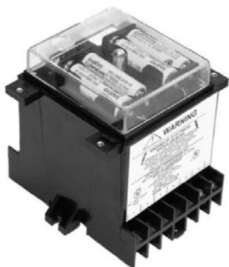
Fig. 1. One of the modern capacitor trip unit providing accumulation and long storage of energy for a feed of trip coil of circuit breaker at absence of an auxiliary voltage

As is known, both auxiliary AC and DC voltages are used at power substations. Use of DC auxiliary voltage increases the essential reliability of relay protection due to use of a powerful battery, capable of supporting the required voltage level on the crucial elements of the substation at emergency mode with the AC power network disconnected. However, this increase of reliability comes at the cost of an essential rise in price of the substation and its maintenance. On the other hand, electromechanical relays of all types do not demand an external auxiliary power supply for proper operation, as their operation requires input signals only. There may be some problem when it is necessary to energize the trip coil of the high-voltage circuit breaker at loss of auxiliary voltage in the emergency mode, but this problem has been solved for a long time and simply enough through use of a storage capacitor. It is constantly charged at the normal operating mode from the AC auxiliary power supply through a rectifier and provides a power current pulse to the trip coil on operation of the protective relay in the emergency mode.