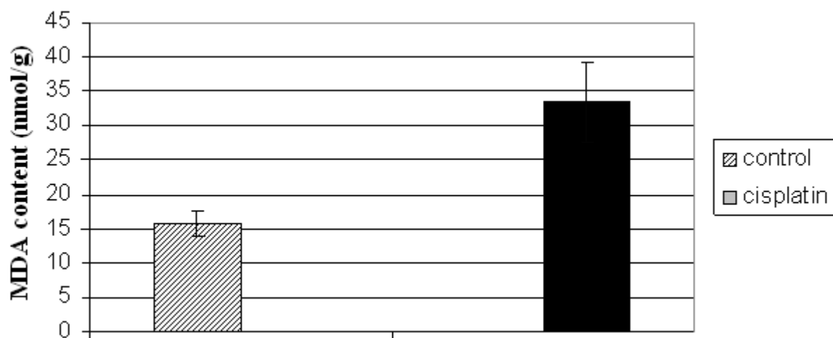
Figure 3. Malondialdehyde levels (nmol/g \pm SD, measured at 535 nm) in the liver of control vehicle- and cisplatin-treated rats (single dose of 6.5 mg/kg body weight)