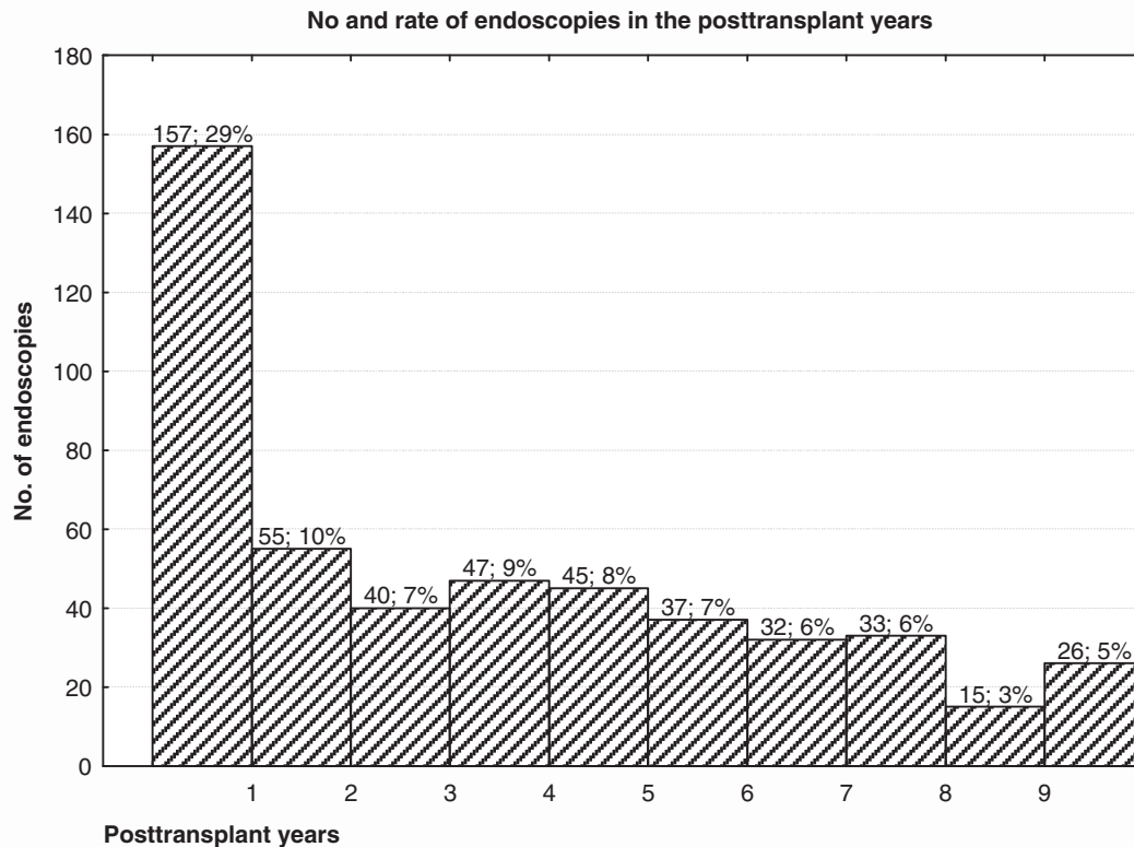
Fig. 1. No. of endoscopies in the post-transplant years.