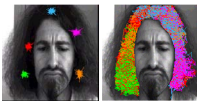
Fig.1. Influence of silk-attraction factor on webs for detection region

A grey level image is the environment in which agents will evolve; stakes correspond to pixels and the height to their grey level. The behavioural items of agents are similar to SA. The movement remains unchanged and silk fixing now depends on the context and, thus, is related to the grey level of the region to detect. The interaction principle is based on stigmergy. To avoid different regions of the same grey level being woven on a unique web a third behavioural item was added to make an agent probabilistically return back to the web [19]. All agents have the same features determined by four parameters. Two parameters govern the movements of the agents and thus the exploration process. The two last ones are related to the selection of pixels, thus determining the relevance of the extracted region. Because the process is based on the stigmergy ensured by the silk draglines laid down in the environment, selection and movement are tied. But we could initially specify the influence of silk attraction factor as shown in figure 1: when it is high (the left picture) the five agents construct five different webs and do not explore the entire region. When it is low (the right picture) the region covered is bigger and corresponds to a collective web. Thus, when well chosen the parameters for stigmergic process allow decentralised coordination.