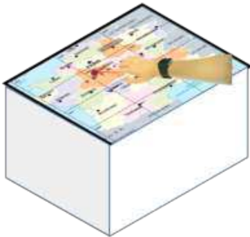
Figure1. Illustration of the 2-step process: Quick-Glance exploration followed by In-Depth guidance.

interests (POI) and streets by executing finger taps. Kane et al. [5] proposed three techniques for assisting visually impaired users' map exploration on a large tabletop: "Edge projection" (projection of the POIs onto the vertical and horizontal edges of the map), "Neighborhood Browsing" (separation of the map into several areas containing exactly one POI), and "Touch and Speak" (verbal directions from the current touch location to the POI).