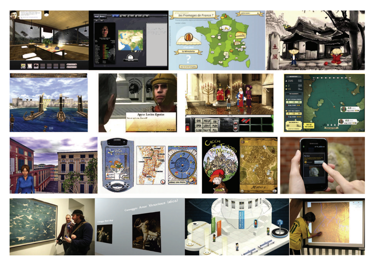
Fig. 1. From top to bottom, each row depicts representative serious games (SGs) for cultural awareness ( Icura, Real Lives 2010, Les Fromages de France, Yong's China Quest ), historical reconstruction ( The Siege of Syracuse, Roma Nova, Time Mesh, High Tea ), architectural/natural heritage awareness ( Travel in Europe, VE-Game, O' Munaciedd, Tidy City ) and artistic/archaeological heritage awareness ( Tate Trumps, Thiatro, Time Explorer, Dessine-moi un Mammouth ).

perform tasks like shooting or avoiding obstacles, mechanics which are hardly related to cognitive gain, but can be included as sub-tasks or mini-games for the sake of engagement. This is the case of Streets of Culture and Ancient Olympia , including respectively driving and sport sessions. The mini-games in Multi-touch rocks can be considered action games as well. However, in this kind of gameplay the learning content is relatively low, and games tackle primarily engagement rather than actual cognitive gain.