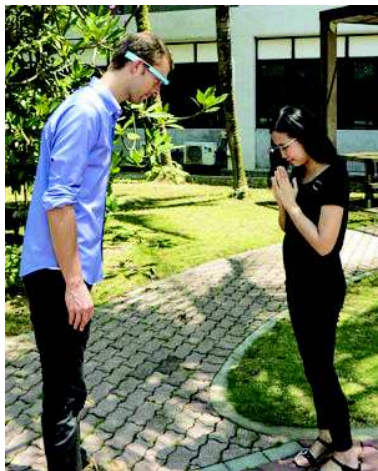
Figure 4. Two users wearing a head-worn display bow and pair devices.

This paper is inspired by the CHI 2015 Workshop on Mobile Collocated Interactions. We thank Dan Ashbrook, Jo Vermeulen and the others for their input.