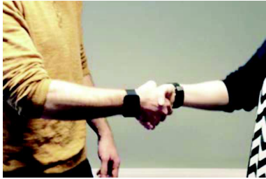
Figure 2 Two people shaking hands using smartwatches.