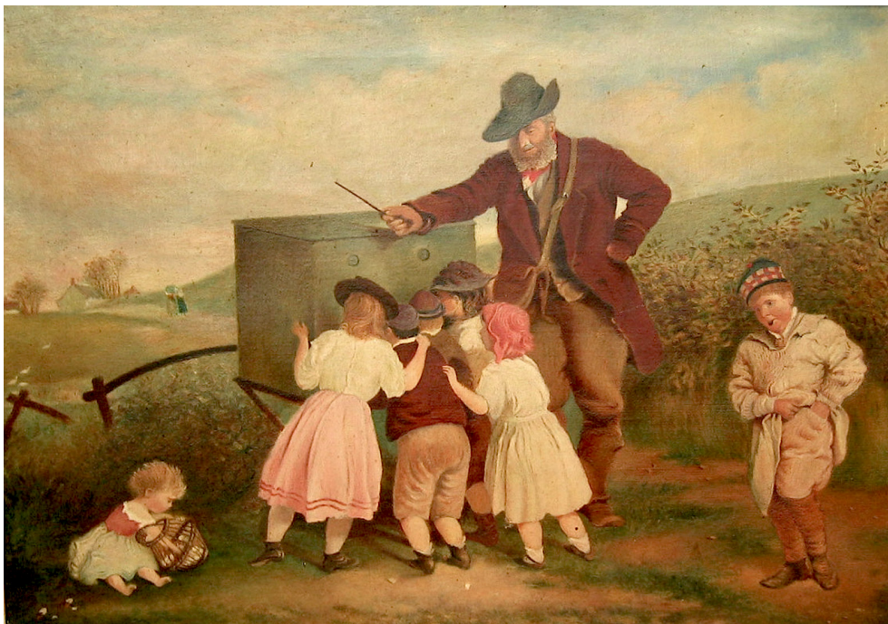
Figure 5. The Peep Show , oil on canvas, anon., Great Britain, c.1840. 8

Boxes of all sorts: portable wooden stereo-scopic boxes, which allowed children to travel to marvellous cities they could hold in their hands; alabaster egg-shaped boxes containing sublime sceneries; dioramic boxes, carrying landscapes that changed with the variation of light ...[c]ontaining illusionist panoramic paintings wrapping the visitor, offering him a real-like experience of the actual place they represented. What all these boxes shared was their hidden and yet liberating spatiality; their physical containment and their ability to take the viewer further, visually and imaginatively.