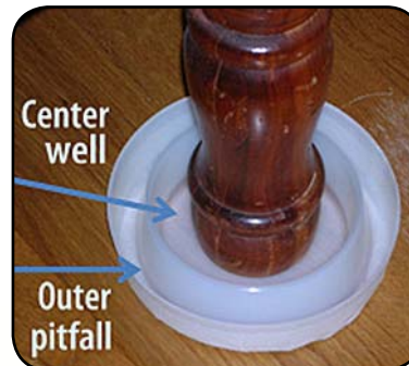
Figure 11. Climbup™ trap for monitoring bed bugs