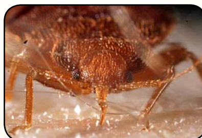
Figure 4. Close-up of bed bug feeding on human