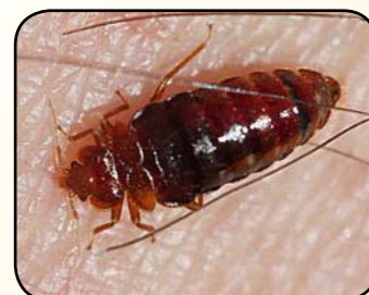
Figure 5. Engorged adult bed bug after feeding