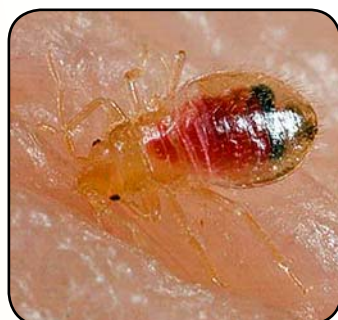
Figure 2. First instar nymph bed bug feeding on human