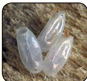
Figure 3. Hatched eggs of bed bugs