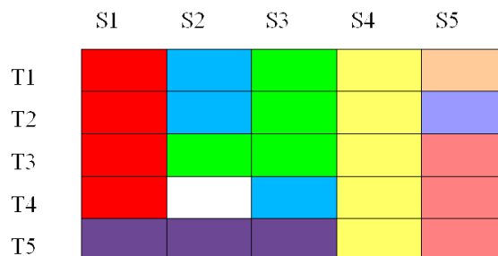
Fig. 1. The structural and thematic dimensions do respectively correspond to columns and rows in the figure. All documents in column S1 for example have structure S1 - or follow schema S1 - while all documents in row T1 have thematic T1. The different information sources are identified by colors. In this example, there are 9 distinct sources, each identified by a given color, among a maximum of 25 potential sources. Each source is defined here as a mixture of several structure and themes, for example, on the left bottom, documents share thematic content T5 and may have structure S1, S2 or S3.

For a classification problem for example, the models will have to classify specific mixtures of content and structure information components corresponding to each source.