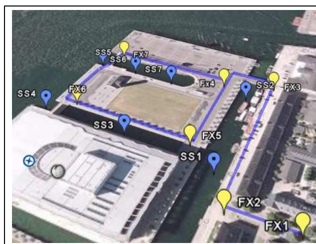
Figure 2. Copenhagen Channel Soundscape

We choose to develop an innovative immersive music application on mobile phones. 3D spatialized sound sources positioned with the help of a geographical information