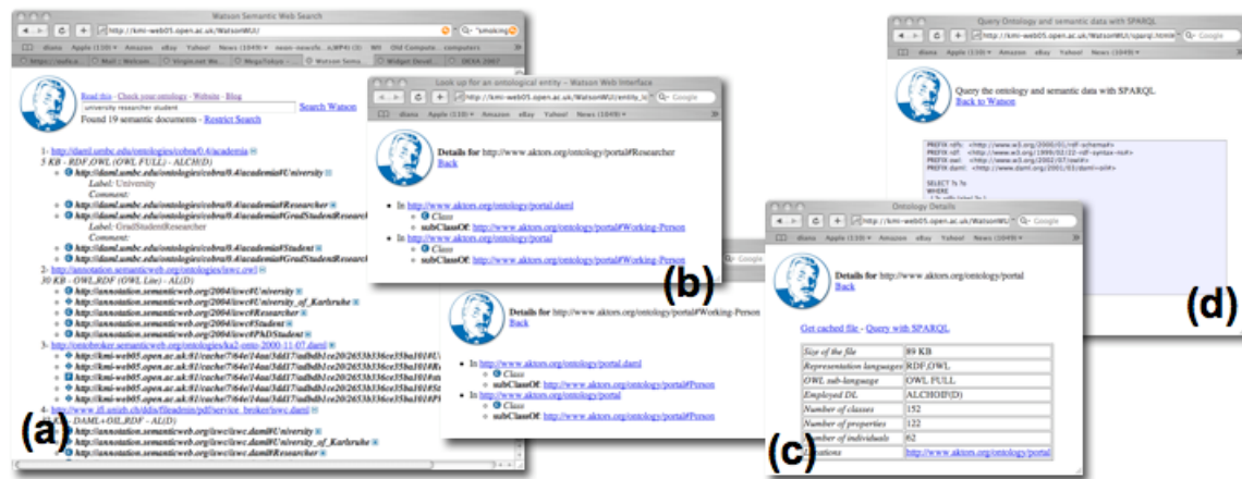
Figure 2. The Watson Web interface ( http://watson.kmi.open.ac.uk/WatsonWUI ).

Ontology exploration. One principle applied to the Watson interface is that every URI is clickable. A URI displayed in the result of the search is a link to a page giving the details of either the corresponding ontology or a particular entity. Since these descriptions also show relations to other elements, this allows the user to navigate among entities and ontologies. For example, with the query “university researcher student”, we obtain 19 matching semantic documents. Among them, http://www.aktors.org/ontology/portal_dam1 contains the entity http://www.aktors.org/ontology/portal#Researcher . Clicking on this URI, we can see that this entity is described (sometimes with different descriptors) in several ontologies (Figure 2(b)). In particular, it is shown to be a subclass of http://www.aktors.org/ontology/portal#Working-Person . Following the link corresponding to this URI also shows its description in each of the semantic documents it belongs to (Figure 2(b)). Then, the metadata corresponding to one of these documents can be retrieved following the appropriate link, e.g. http://www.aktors.org/ontology/portal , to find out about its languages, locations, etc. (Figure 2(c)). Finally, a page describing a semantic document provides a link to the SPARQL interface for this semantic document, as described in the next paragraph.