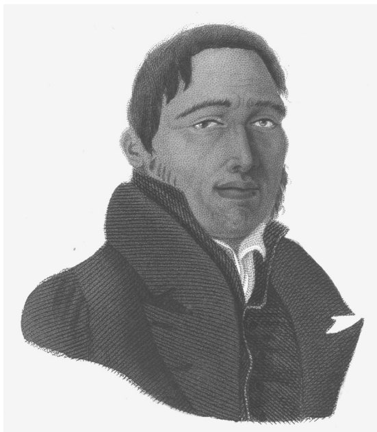
Portrait of Kalanimoku in 1819 by Alphonse Pellion. Portion of Plate 84, Atlas Historique, prepared for Louis Claude de Saulces de Freycinet's Voyage Autour du Monde, 1825.

Kamehameha II. Under the influence of his mother, Keōpūolani, and Ka'ahumanu, the great chiefs favorite wife, a reluctant Liholiho went along with the wishes of the two powerful chiefesses and proclaimed an end to the kapu system under which the Hawaiian people had lived since ancient times. He then sent messengers throughout the islands ordering the destruction of heiau and images of the gods. 28