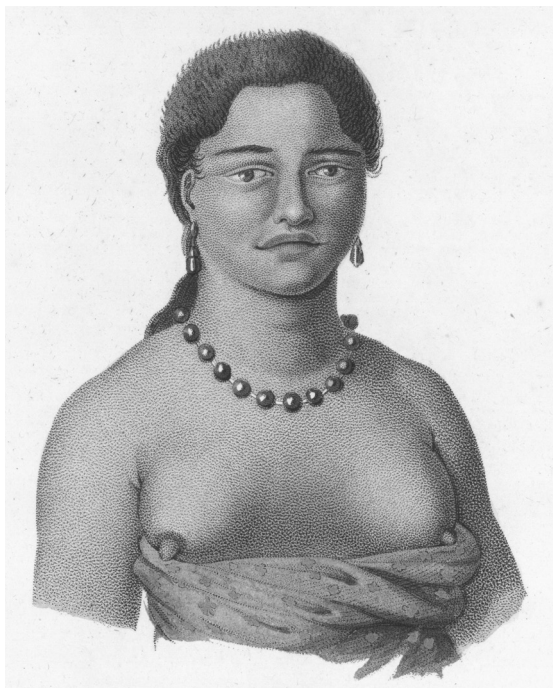
Portrait of Likelike, a wife of Kalanimoku, in 1819 by Alphonse Pellion. Portion of Plate 83, Atlas Historique , prepared for Louis Claude de Saulces de Freycinet's Voyage Autour du Monde , 1825. State Archives of Hawai'i.