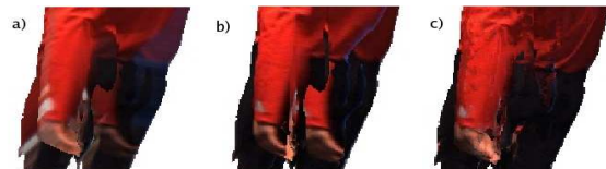
Figure 2: a) View dependent, b) View independent, c) Our method

We set the resolution of the rendered novel view to 512x512, and we tested the algorithm for a model of about 5000 polygons. On a Intel 2.40GHz CPU and a GeForce4 Ti 4800 graphic card, the frame rate is of 17 fps.