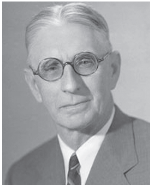
James Drummond Dole as a senior citizen, undated.

After his dismissal as general manager of the Hawaiian Pineapple Co. in October 1932, Dole tried to find a new career in the continental United States. In July 1933 the Roosevelt Administration appointed Dole to the Agricultural Adjustment Administration (AAA) as Chief of the Food Division. Dole soon decided that he was not well-suited to the life of a government bureaucrat and not in sympathy with the New Deal. He tendered his letter of resignation in December of the same year. 51 Hawai'i's business leaders must have been horrified to learn a month earlier that Dole was being considered for the position of governor of Hawai'i. 52 After the AAA Dole became involved in a gold dredging venture in Ione, California. It produced mixed results. At the end of 1937 he returned to the food business with the formation