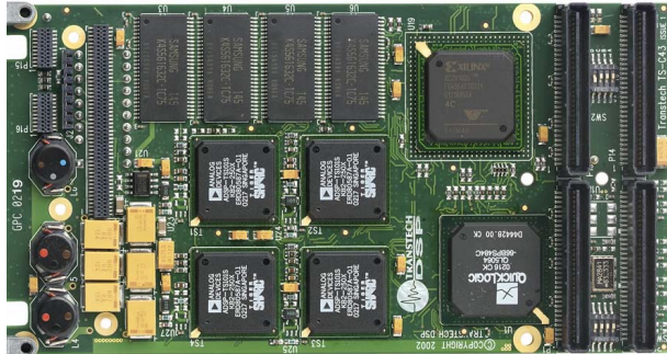
Fig. 2. The TS-C43 PMC board

The numerical processing is computed using two TS-C43 PMC from VSystems [12]. Each board (fig. 2) comprises 4 clustered TigerSHARC DSP allowing a 300 MHz processing, a Xilinx Virtex-II FPGA and a 528 Mo/s PCI connection.