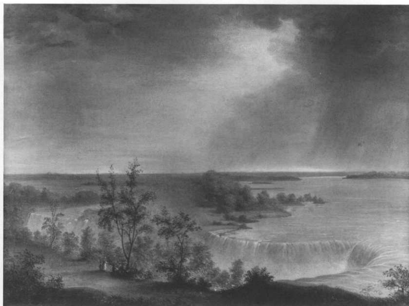
FIG. 6. Rembrandt Peale, Niagara Falls, A General View , 1831, 47 × 61 cm. Lowe Art Museum, University of Miami, Coral Gables, Florida. Gift of Allan Gerdaud. (Roland I. Unruh.)

tieth-century value system that a painting by an important artist is somehow more important than the non-Western art object it depicts.