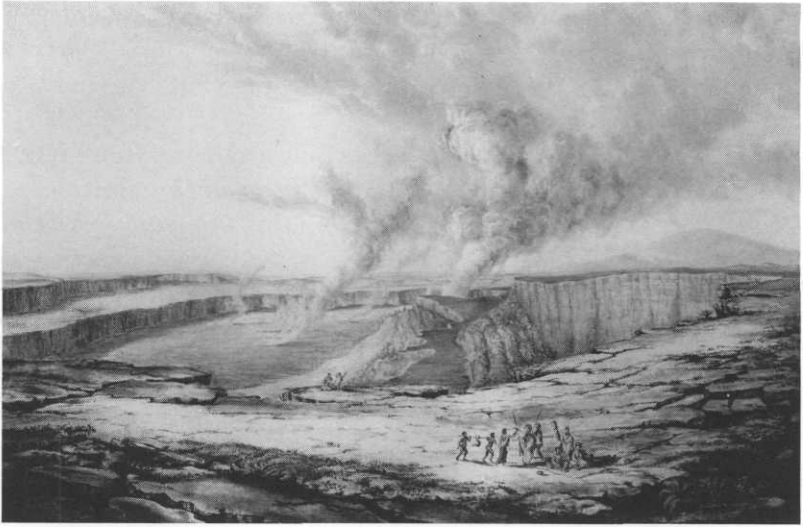
FIG. 5. Titian Ramsay Peale, Day View of Kilauea Volcano , 1842, 51.5 × 76.5 cm. Bishop Museum, Honolulu. Gift of Albert Rosenthal, 1924. (BPBM.)

Titian. This type of helmet is very rare and there is little doubt that the one depicted is the one now in the Peabody Museum, Harvard. 13