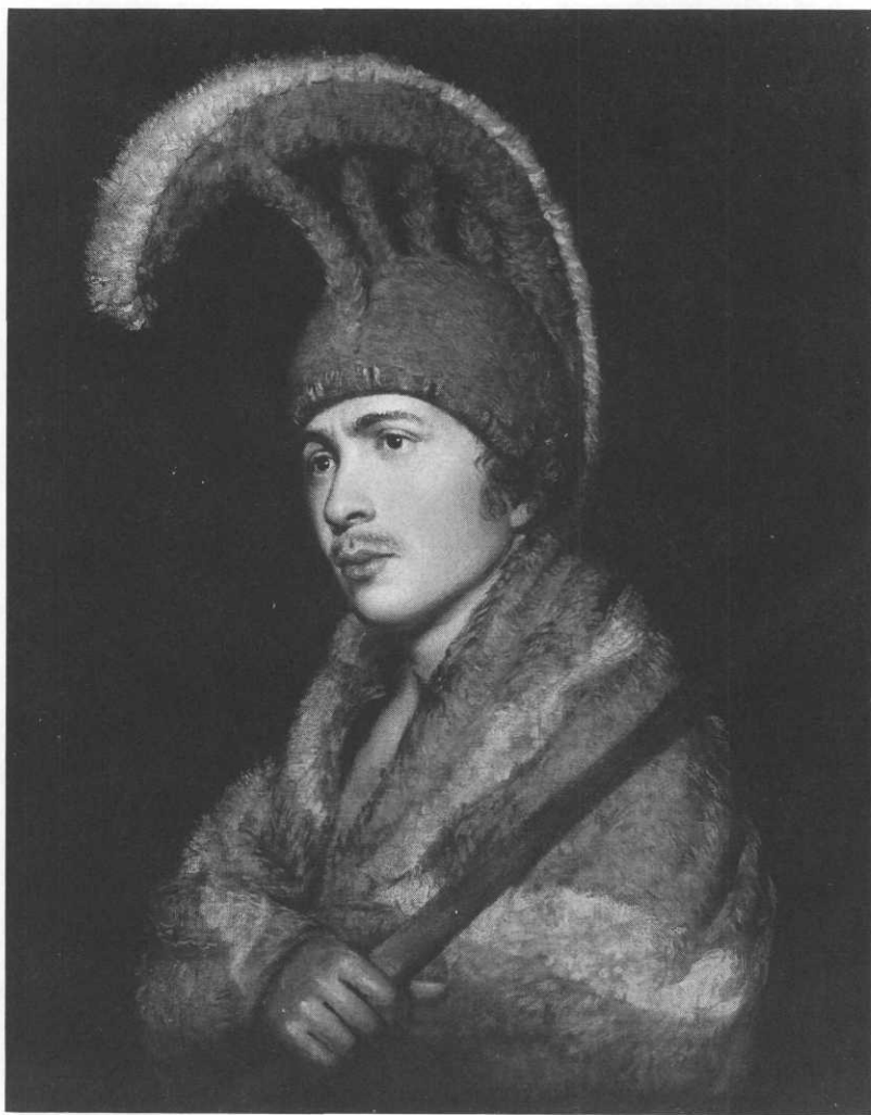
FIG. 1. Rembrandt Peale, Man in Hawaiian Regalia , ca. 1800, 76.2 × 63.2 cm. Bishop Museum, Honolulu. Bequest of Helene Irwin Fagan, 1966-67. (BPBM.)

. . . a singular work [that] would be an unsurpassed achievement for Rembrandt and has remained one of the most original images in the history of American art." 22 The two paintings are similar in size (Honolulu 76.2 × 63.2 cm; Washington 71 × 61 cm), both are portraits with the sitter's right hand grasping part of a still life,