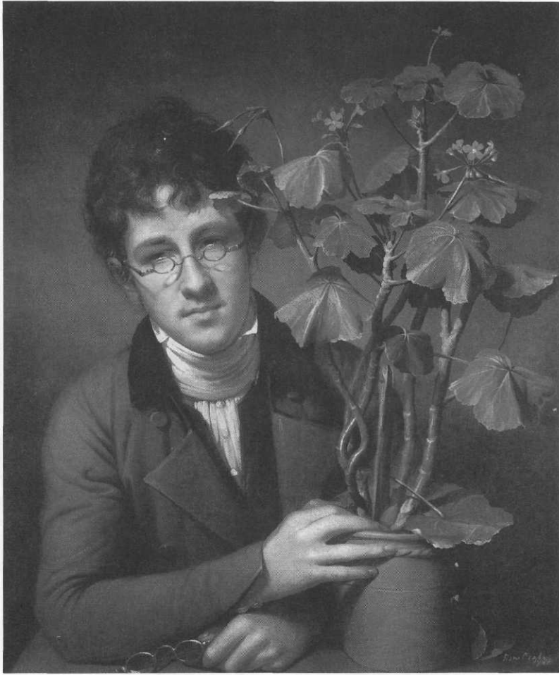
FIG. 2. Rembrandt Peale, Rubens Peale with a Geranium , 1801, National Gallery of Art, Washington, D.C., 71 × 61 cm. (National Gallery of Art.)

and together they illustrate both the ethnographic and natural history emphases of the wide-ranging collections of Rembrandt's father, Charles Willson Peale (1741-1827), in whose museum they were probably both painted. The paintings also illustrate Rembrandt's artistic vision of the parallel importance of portraiture and science—found in many of the artistic works and museums of the Peale family. Finally, both works feature scientific “firsts”—