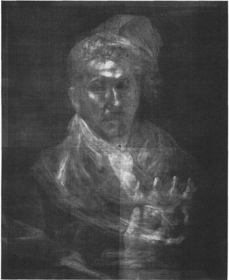
FIG. 3. X-ray showing Self-Portrait with Mastodon Tooth by Rembrandt Peale, 1803, under portrait of Sarah Franklin Bache, 71.1 × 60.3 cm. Private collection.

meaning to Rembrandt as he and Washington shared the same birthday, and Rembrandt painted his first portrait of Washington in 1795. It is a pity that Rembrandt did not depict the featherwork on Washington himself. I suggest that the painting was executed between 1792 (when the objects were presented to Charles Willson