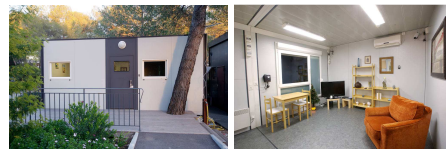
Figure 1 Gerhome laboratory pictures