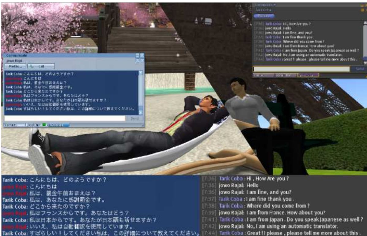
Figure 2: Automatic translation between a Japanese and a French avatar