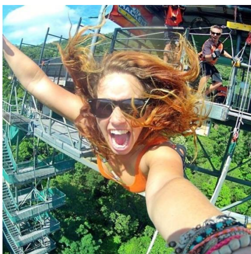
Figure 3. Crazy and original selfies ( http://batona.net )

Social networks have simplified this process greatly. SMM users compete in resourcefulness, courage, and insanity while creating self-shots (see Figure 3). Self-shot a snapshot of yourself (using a smartphone / a mobile phone) and then this snapshot is posted in social networks ( https://www.drive2.ru ).