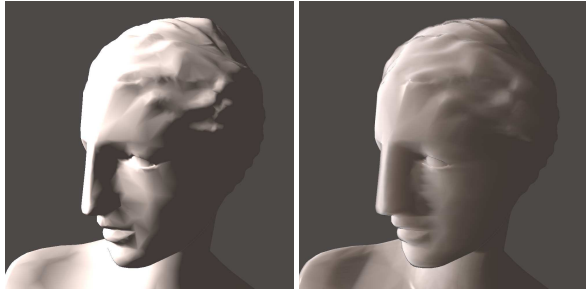
Figure 1: Marble statue without (left) and with (right) subsurface scattering.