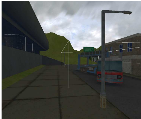
Fig 3: The image computed by the camera we are evaluating with respect to the properties in Table 3

In this Section, we show how to use CEL to measure the accuracy of the approaches proposed by Burelli et al. [5] and Christie et al. [8] for a specific situation, i.e. the camera from which the picture in figure 3 has been rendered. The set of screen-space properties we consider in this example are (in the formulation adopted in [5]) listed in the first column of Table 3 ( t is the transporter in figure 3, which shows also its bounding box); their CEL equivalent expressions are shown in the third column of the same table.