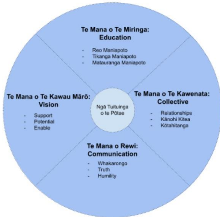
Figure 7: Ngā Tuituinga o te Pōtae.