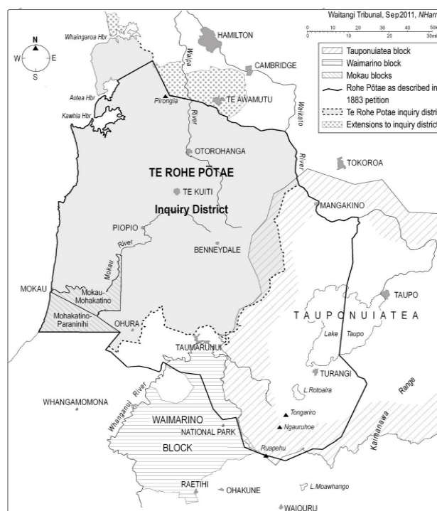
Figure 2: 1883 Waimarino block and Tauponuiatia block

Note: Sourced from He Maungarongo, p. 326, 238. Marr, 'The Waimarino Purchase Report'. p. 15