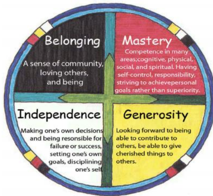
Figure 4: The Circle of Courage model

Note: Sourced from Paddling as resistance? Exploring an Indigenous approach to land-based education amongst Manitoba youth. Johnson and Ali, 2020, p.211