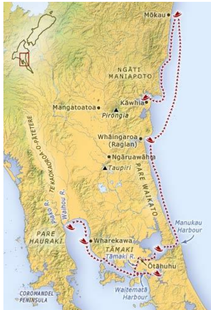
Figure 1: Tainui Map

Note: Tainui Geographical make up. From the Tainui settlement area. Sourced from Te Ahukaramū Charles Royal, 'Waikato tribes - The Waikato confederation', Te Ara - the Encyclopedia of New Zealand