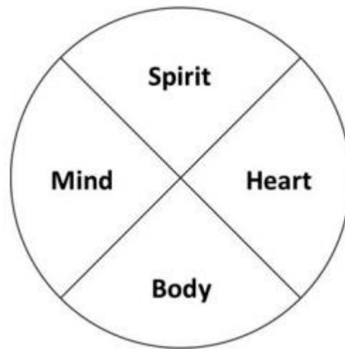
Figure 5: The Medicine Wheel framework