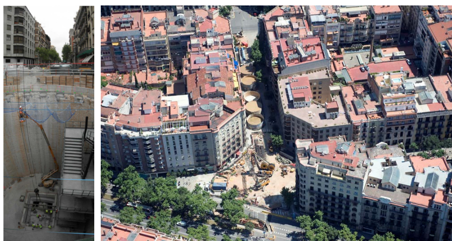
Figure 2. Conventional construction of ventilation and emergency exit shaft in Bruc street in Barcelona.

The first shaft is located at the crossing of Bruc Street with Provença Street (see Figure 2). It was built according to the conventional process of a diaphragm wall excavated using a hydromill and has an inside diameter of 20 m. The reinforced walls, which are 1.20 m thick, extend 43 m below ground level. The construction work consisted of three phases involving different land occupation. The second shaft is located at the crossing of Enric Granados Street with Provença Street (see Figure 3). At the request of the Barcelona City Council, in order to reduce the social impact of the construction, the design of this shaft was different. It was built with a vertical shaft sinking machine (VSM) and has an inside diameter of 9 m and a depth of 47 m. The shaft casing consists of concrete rings with four arches with a thickness of 0.40 m. The construction work was also performed in three phases. For a more detailed description of the case study, input data, and performed calculations, refer to Casanovas-Rubio [44], (pp. 133–139).