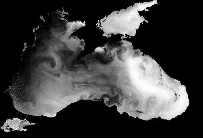
Fig. 1. SST image of the Black Sea given by NOAA/AVHRR.

has been extensively studied [5, 6, 7, 8, 9, 10, 11, 12, 13]. The classical computer vision approach relies on a dense estimation of the displacement velocity based on the so-called conservation of gray level-value assumption (also called optical flow constraint): given a pixel (x(t), y(t)) on an image I at time t , we have: